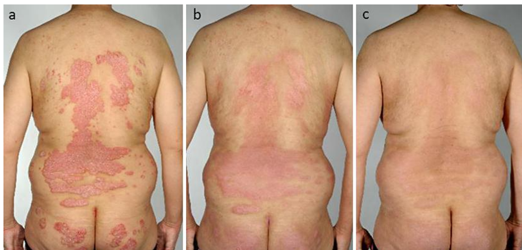
Fig. 1. Marked improvement of psoriasis during treatment with adalimumab. a Before treatment. b After 3 months. c After 8 months.

Yayli et al.: Adalimumab in Recalcitrant Severe Psoriasis Associated with Atopic Dermatitis