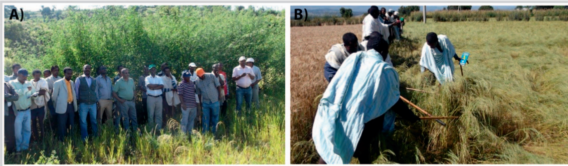
FIGURE 1 Learning watersheds used as live learning platforms: (A) regional policymakers led by the regional president appreciating progress in a learning watershed; (B) farmers checking a newly introduced crop variety and comparing it with their local variety.

Over the last centuries, water and land resources in the Ethiopian Highlands have been subject to increasing demand from subsistence farming and other forms of agriculture. This has had negative on- and off-site effects, both in Ethiopia and in downstream countries. Increased sediment load in the Nile River, leading to siltation of downstream hydropower and irrigation dams in Ethiopia, Sudan, and Egypt, poses a major threat to infrastructure investments as well as to local livelihoods. At the same time, the loss of fertile soil and nutrients has reduced the productivity of rain-fed agriculture in the Ethiopian Highlands.