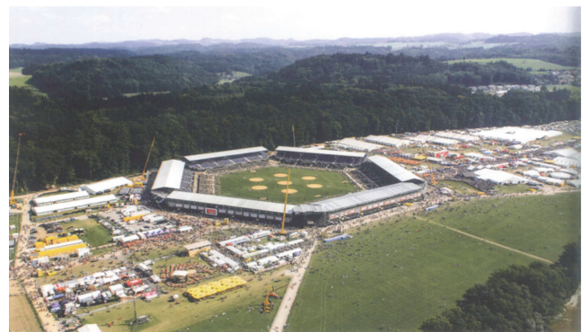
FIGURE 2: Overview over the main part of the venue.

senior staff member of civil defense. This on-site operational management team was located directly on the festival ground and communicated closely with the medical assistant points and hospitals if necessary.