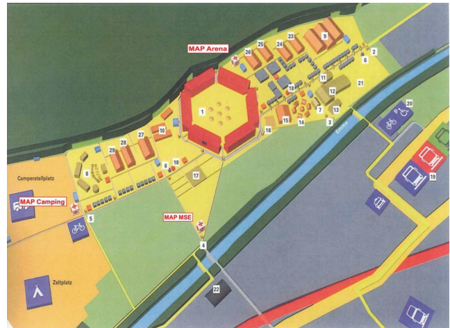
FIGURE 1: Overview of the event site and medical assistant points (MAP).

The civil EMS coordinated the medical care on site, together with the Swiss Armed Forces and Swiss civil defense, that supported the EMS with medically trained personnel and equipment. The on-site operational management team comprised two senior staff members of the Bern EMS and one