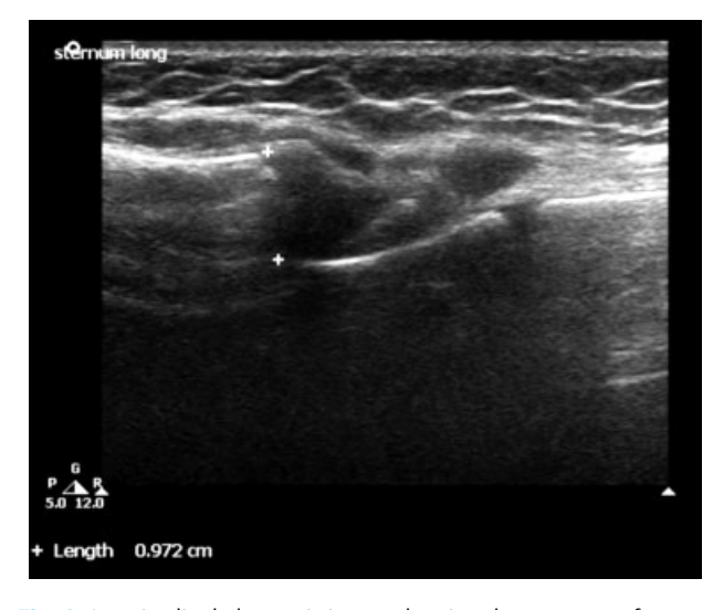
Fig. 1 Longitudinal ultrasonic image showing the transverse fracture of the manubrium sterni with dorsal displacement of the distal fragment by 0.97 cm.