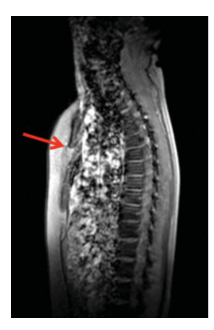
Fig. 2 T2-weighted sagittal MRI showing the fracture (indicated by arrow) of the sternum. MRI, magnetic resonance imaging.

Both sternum fractures were managed nonoperatively. Because of persisting chest pain, especially during breathing, the children were admitted to the in-patient ward for observation and pain management. Sport participation was discouraged for 3 months. Sonographic follow-up after 9 months demonstrated consolidation of the fracture and sufficient remodelling of the sternum in both children ( -Fig. 5 ).