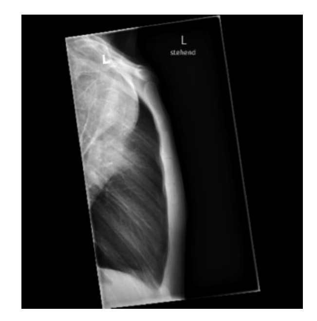
Fig. 3 Lateral chest X-ray without signs of fracture.

noise in the area of his sternum. Physical examination revealed tenderness without swelling above the body of the sternum. Auscultation of the lungs and heart revealed no pathological findings, and the electrocardiogram (ECG) was normal. Anterior-posterior chest X-ray was normal. Ultrasonic imaging revealed a transverse fracture of the manubrium sterni with dorsal displacement of the distal fragment by 0.97 cm ( - Fig. 1) in the absence of pericardial effusion. The displaced sternal fracture without combined intrathoracic injuries was confirmed by MRI ( - Fig. 2).