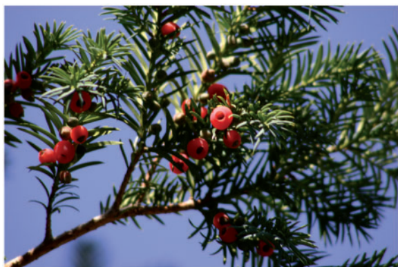
Figure 3. Taxus baccata leaves with berries.

presented with typical symptoms of Taxus intoxication, i.e. broad-complex brady/tachyarrhythmia with atrioventricular blockade, depressed consciousness and respiratory distress. 2-4,6-8 Further signs of yew intoxication are nausea, vomiting, abdominal pain and seizures, all of which could not be determined in the patient due to reduced consciousness. In line with earlier reports, 9 our patient informed himself about the toxicity of Taxus baccata on various web sites.