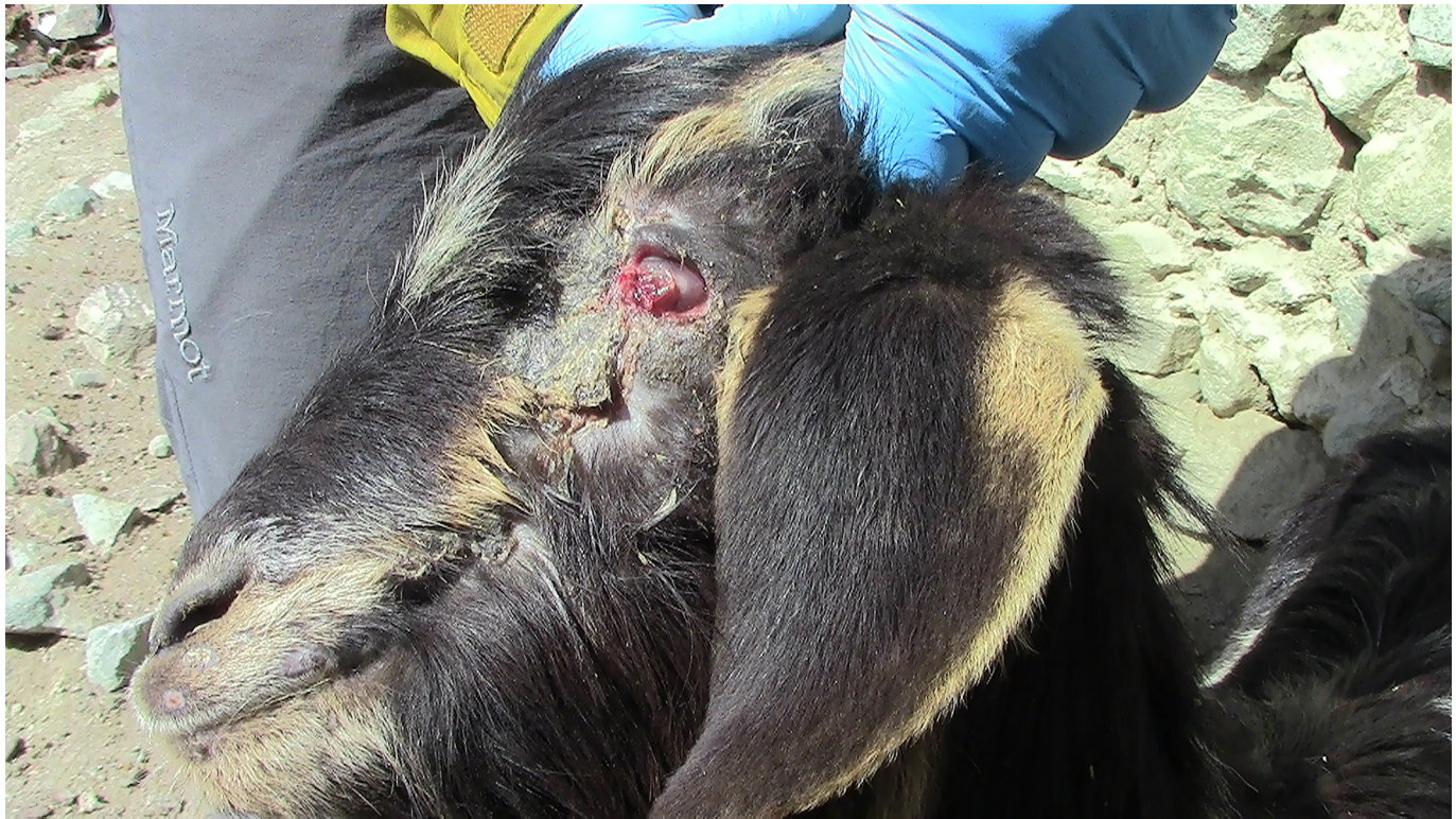
FIG 2: Image of a goat exhibiting a severe stage of infectious keratoconjunctivitis, with bilateral panophthalmitis, lacrymation, hypopyon and perforation of the cornea. Mycoplasma conjunctivae was confirmed in eye swabs by qPCR.

M. conjunctivae and Chlamydiaceae were detected in asymptomatic and clinically affected eyes of sheep and goats from the CKNP, Gilgit-Baltistan district of Pakistan. These results agree with the previously reported sporadic IKC cases in sheep flocks with endemic M. conjunctivae infections and its capability to establish asymptomatic ocular infections. 8,37 Reports of non-epidemic IKC in goats are scarce 38 and most of the IKC descriptions refer to outbreaks. 39,40 However, the results obtained in this study suggest that M. conjunctivae is endemic in mixed sheep-goat flocks of the CKNP area. Although M. conjunctivae