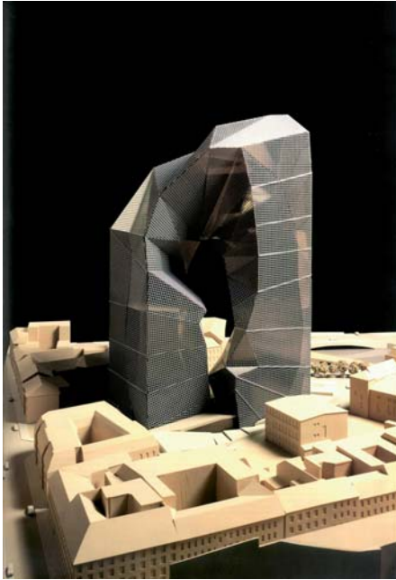
Fig. 6: Peter Eisenmann, Max Reinhardt Haus, Berlin 1992.

Burj Khalifa (former Burj Dubai), Adrian Smith from SOM designed the world's tallest skyscraper – for a while at least. With its height of 828 meters above ground, the building is advertised as a place where one can enjoy “the sky above the sky”. In even more superlatives, the “Burj Khalifa skyscraper is a world-class destination and the magnificent centerpiece of Downtown Dubai, Dubai’s new urban masterpiece”. 23 The telescope-like structure with several shafts has its summit in a needle peak. The entire shape can be seen as a dynamization of SOM’s most famous building, the Chicago Sears Tower (built 1970–1974) – which itself was for a long time the world’s tallest building. Conforming to Dubai’s ruler and CEO Sheik Mohamed Al Maktum creed – “I want to be the number one in the world” 24 –, the Burj Khalifa takes its leading position among a number of mega-projects, such as the world biggest theme-park, the three artificial palm islands, the spinnaker-shaped hotel, Burj al Arab, or the projected Dubai waterfront by Rem Koolhaas/OMA. Together, these mega-projects contribute to the creation of Dubai as a new prototype of the post-global