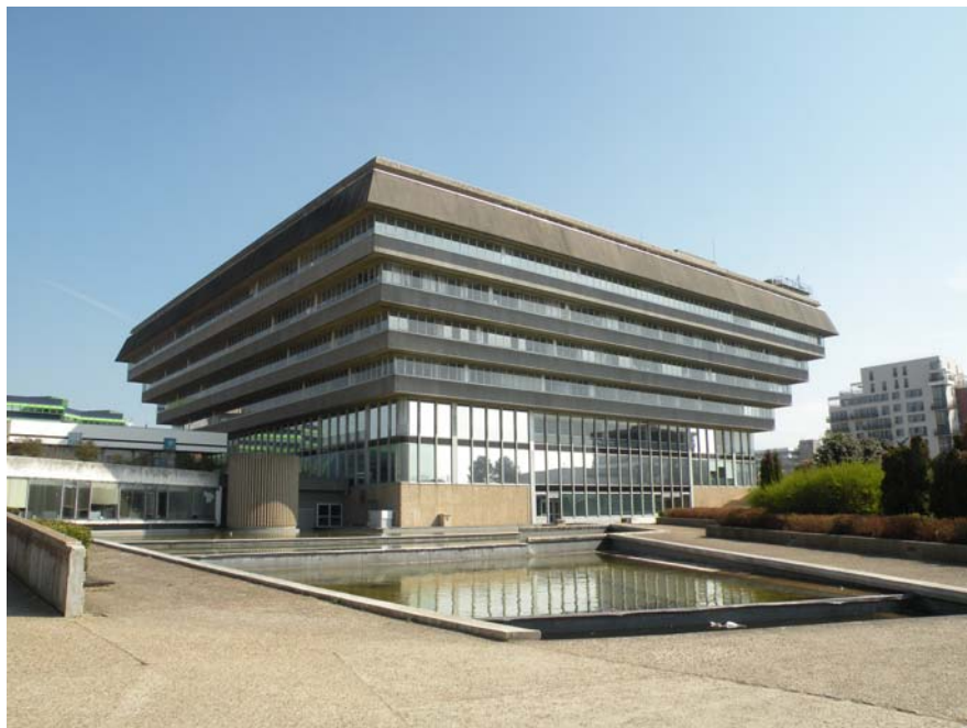
Fig. 1: Hôtel de Prefecture du Val-d'Oise, 1967–1970, Henry Bernard (with Robert Decosse et Pierre Mougin).