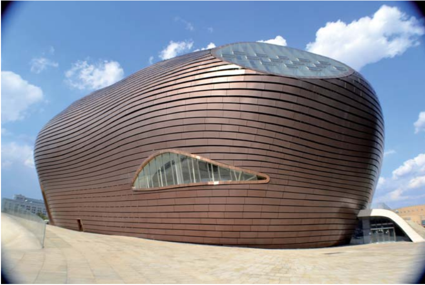
Fig. 10: Ordos Museum 2011, Kangbashi District, Inner Mongolia (Peoples Republic of China), MAD Architects (2006–2011).

monumental conceptions. What has changed in the age of globalization, with its focus on global consumerism, is the social context of monumental architecture. “Bigness” and monumentalism are both principles of a new type of architectural brand, such as Koolhaas, Foster etc. After having neglected monumentalism in classical modern architecture, Le Corbusier and Louis Kahn renewed the idea of a sculptural based monumental shape for public buildings as a form of brutalist architecture. This conception was remodeled by Rem Koolhaas, whose notion of “Bigness” can be seen as the most influential inspiration for recent architecture. The actual challenge lies in avoiding representations of pure consumer architecture. In most cases, monumentalism in contemporary architecture represents specific ideologies. It is hardly surprising, then, that some of the most ambitious projects are directly linked with authoritarian political systems. Besides these forms of utilization, the architects of our time face the challenge of shaping monumental spaces for a lively and open community.