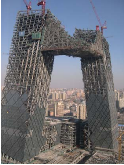
Fig. 3: Rem Koolhaas, Ole Scheeren/OMA, CCTV Tower Beijing, 2002–2008, under construction, 2008.