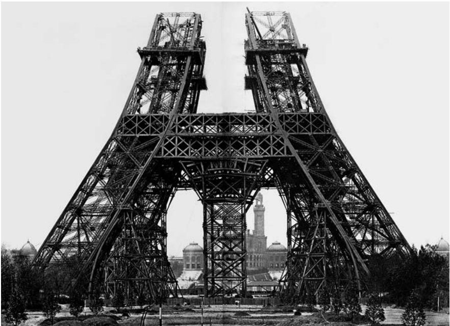
Fig. 4: Paris, Eiffel Tower, 1889, under construction.