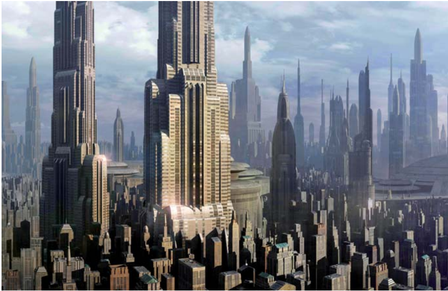
Fig. 8: Star Wars , Coruscant Cityscape, Film Still.

This includes both sides of contemporary monumentalism: on the one hand, to follow the tradition of city-crown monuments, and on the other hand to create real structures out of fiction. Obviously, Dubai's cityscape with Burj Khalifa at the top is very much reminiscent of one of the most popular science-fiction cityscapes, George Lucas' city of "new hope", Coruscant City, which in Star Wars: Episode VI – Return of the Jedi becomes Princess Leia's home. Lucas' vision of a "used future" was further popularized in other science fiction-films 29 and with buildings like the Burj Khalifa even translated into real environments.