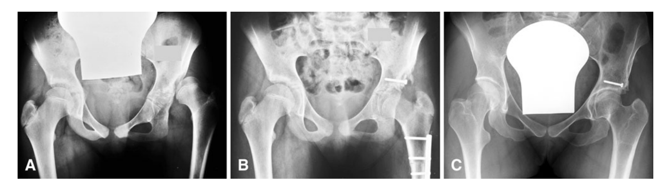
Fig. 2A–C Images illustrate the case of Patient 2, a female patient who at 13 years old had low congenital dislocation of the left hip; she suffered from a substantial limp and moderate pain. (A) Pre- and (B) postoperative radiographs show the hips before and after the patient underwent capsular arthroplasty with a subtrochanteric

* ICC = intraclass correlation coefficient, two-way random-effects model (absolute agreement).