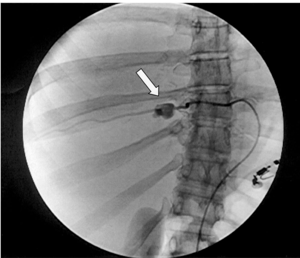
Fig. 2. Selective angiography demonstrating the intercostal aneurysm (arrow).

without any pathological findings. However, there was a spot of contrast medium surrounded by a capsule in the hemothorax on the right side (Fig. 1). Because of the previous history of a lumbar aneurysm, an aortography was performed: this investigation demonstrated a ruptured aneurysm of an intercostal artery (Fig. 2). In view of the previous difficulties in aneurysmal repair, an endovascular procedure was selected. The aneurysm was successfully embolized with several fibred platinum coils (Vortex ® fibred platinum coil-18, Boston Scientific/Target, Galway, Ireland) which allowed to block the arterial feeding from both sides. A chest drainage was placed in the right pleural cavity after the intervention. However, several days after initial bleeding, the hemothorax was already organized. Because of impaired oxygenation, the patient underwent two days later successful thoracoscopic evacuation and