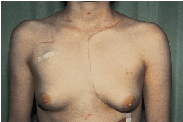
Fig. 3. The cosmetic result observed 2 weeks after a hemiclamsell incision required to access an aspergilloma invading the left subclavian artery.

of the pulmonary veins. In the two patients with non small cell lung carcinoma (NSCLC) who suffered iatrogenic lesions during mediastinoscopy, therapy required repair of the azygos and innominate vein, respectively, followed by lobectomy and mediastinal lymph node dissection.