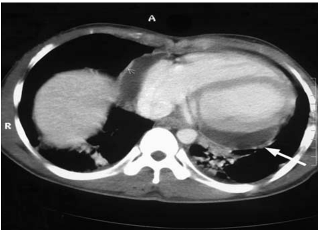
Fig. 2. A 27-year-old man with fever and signs of upper venous flow obstruction whose computed tomography scan of the chest shows a large pericardial effusion (arrow).