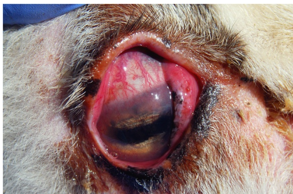
Figure 2 One of the more severe IKC cases observed during the study period, eye of a domestic sheep from the Pyrenees showing epiphora, conjunctival hyperemia, peripheral corneal edema, and neovascularization.

sampling periods (Table 1) indicate that M. conjunctivae infection is widespread among domestic sheep in the Pyrenees, endemic and self-maintained within domestic sheep flocks. This agrees with previous data on M. conjunctivae prevalence (25.8%) in domestic small ruminants from Central Pyrenees [12] and the wide distribution of M. conjunctivae infection in domestic sheep throughout Europe [4,7]. In contrast, the lower prevalence found in the Cantabrian Mountains and the fact that M. conjunctivae was detected in only one flock in this region suggest that M. conjunctivae is currently less common in this area. Moreover, the only M. conjunctivae -positive flock in the Cantabrian Mountains seasonally migrates to Caceres (South-Western Spain) in winter. Hence, the origin of M. conjunctivae in this flock is unclear and could lead to an overestimation of the endemic situation of M. conjunctivae in this region. Furthermore, the occurrence of M. conjunctivae relative to IKC cases in the two study areas strongly differed. Whereas there is a good agreement between IKC cases and the presence of M. conjunctivae in the Pyrenees, this is not the case in the Cantabrian Mountains.