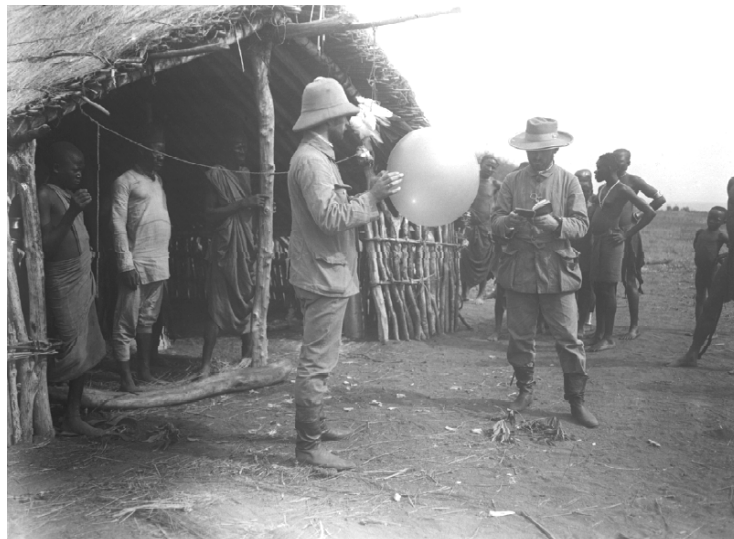
FIGURE 2 Colonial data form part of current products on which decisions are based. German aerologists in the East African colonies in 1908, measuring vertical wind profiles using balloons (Brönnimann and Stickler, 2013)

Third, climate data products carry imprints of social, political and economic contexts, which should not be dismissed as irrelevant or nonexistent. As an example, we can examine development cooperation. Early colonial climate data (see Fig. 2 for an example) contributed to shaping world views, depicting the tropics as an imagined space and to the notion of environmental determinism (Livingstone, 1999; Mahony and Endfield, 2018). They were an instrumental part of colonialism. Although the measurements themselves do not convey attitudes, some of these data, influencing our decisions today, still carry colonial roots. By producing full-coverage data products of past climate and analyzing climate processes over the former colonies, western science today has to be careful not to „re-colonize“ their atmosphere (Gregory, 2001). Being aware of data histories may sensitize for this aspect. Despite the enthusiasm for open data in so-called developing countries, questions of data policy, ownership, co-authorship, and location of data holdings should be discussed under this point of view. For instance, precipitation data based on mobile communication links seem promising for developing countries (Tollefson, 2017), but might raise proprietary concerns.