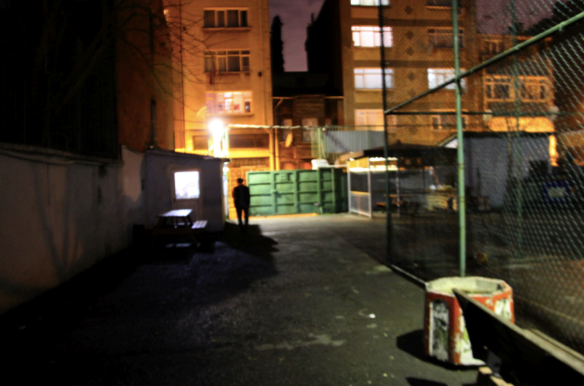
The guard stands by the night