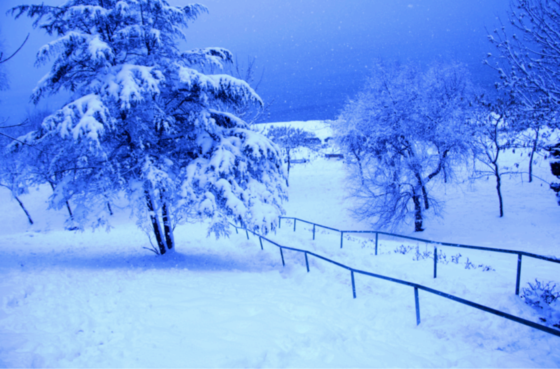
Stairways to heaven.