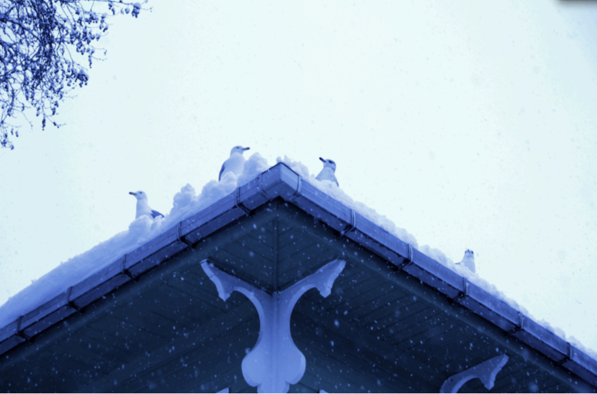
The mirror effect: a dialogical site