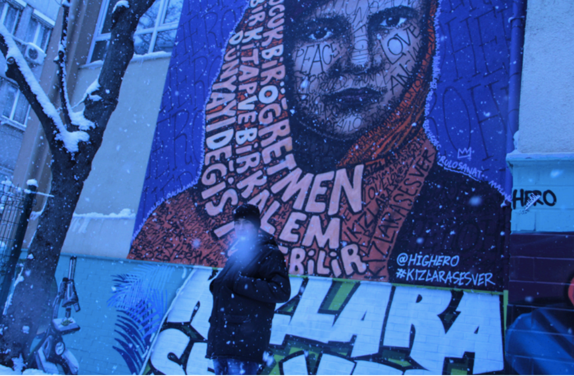
A teacher ,a child , a book and a pencil can change the world.