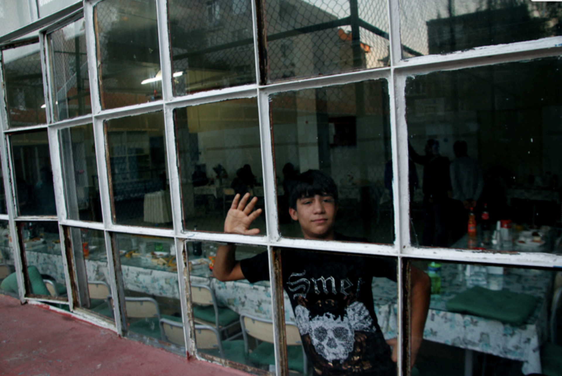
Sünnet Without family