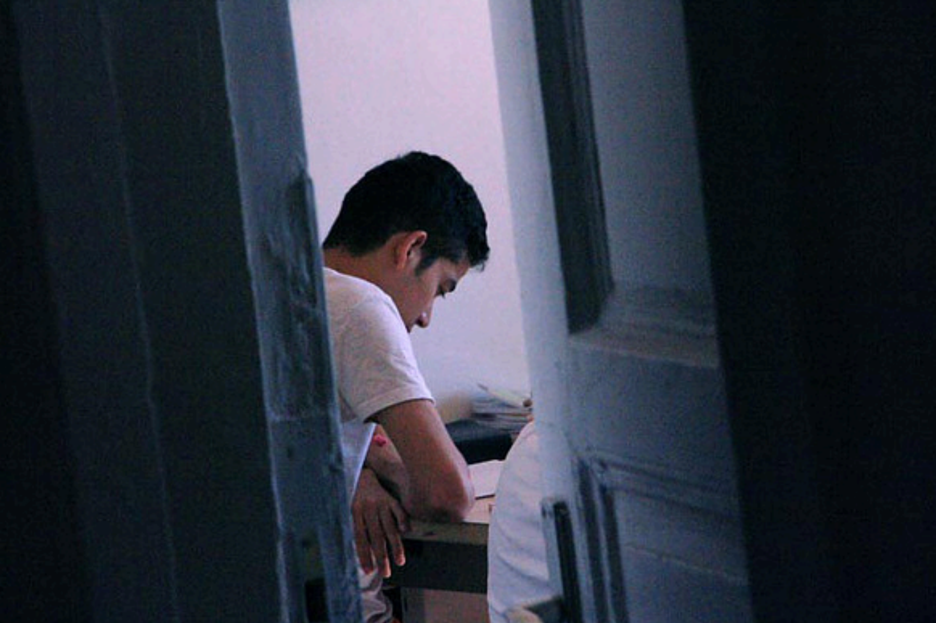
Studying behind the closed doors.