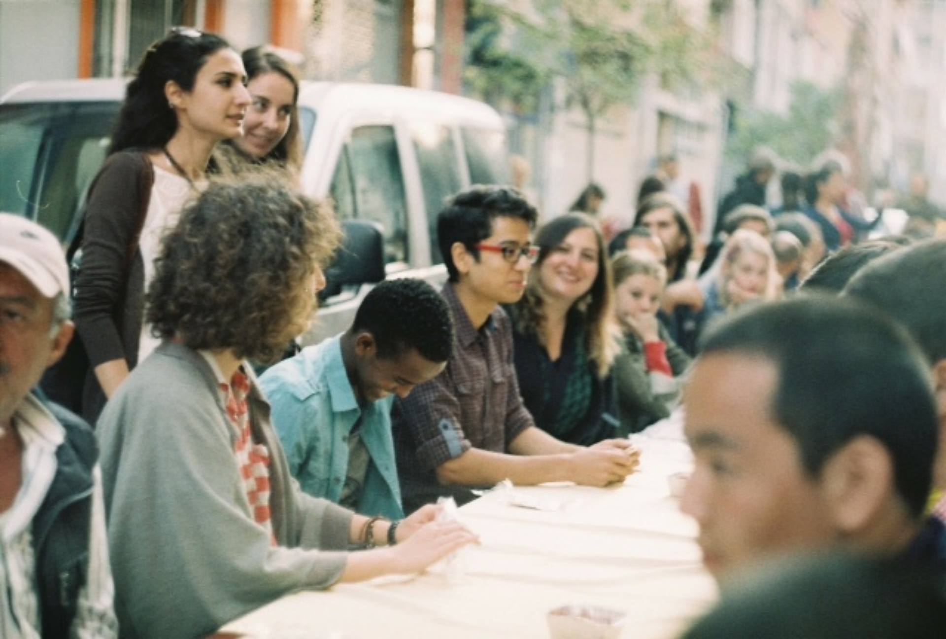
Accessing the Field at times of Solidarity