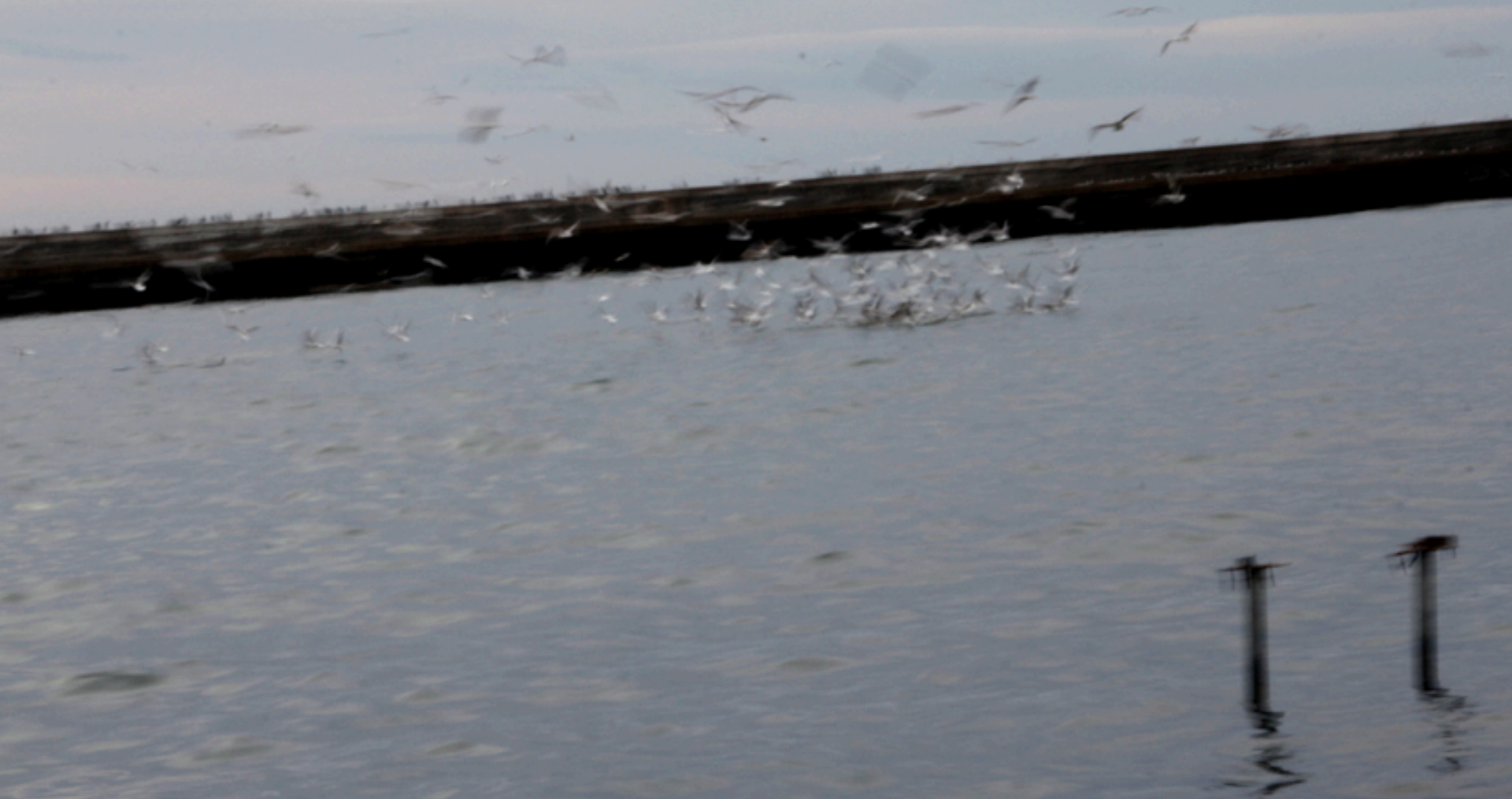
Catastrophe on the sea

The realm of conscious and unconscious process in which a displacement of the angle of vision is the difference between life and death and survival (Bhabha).