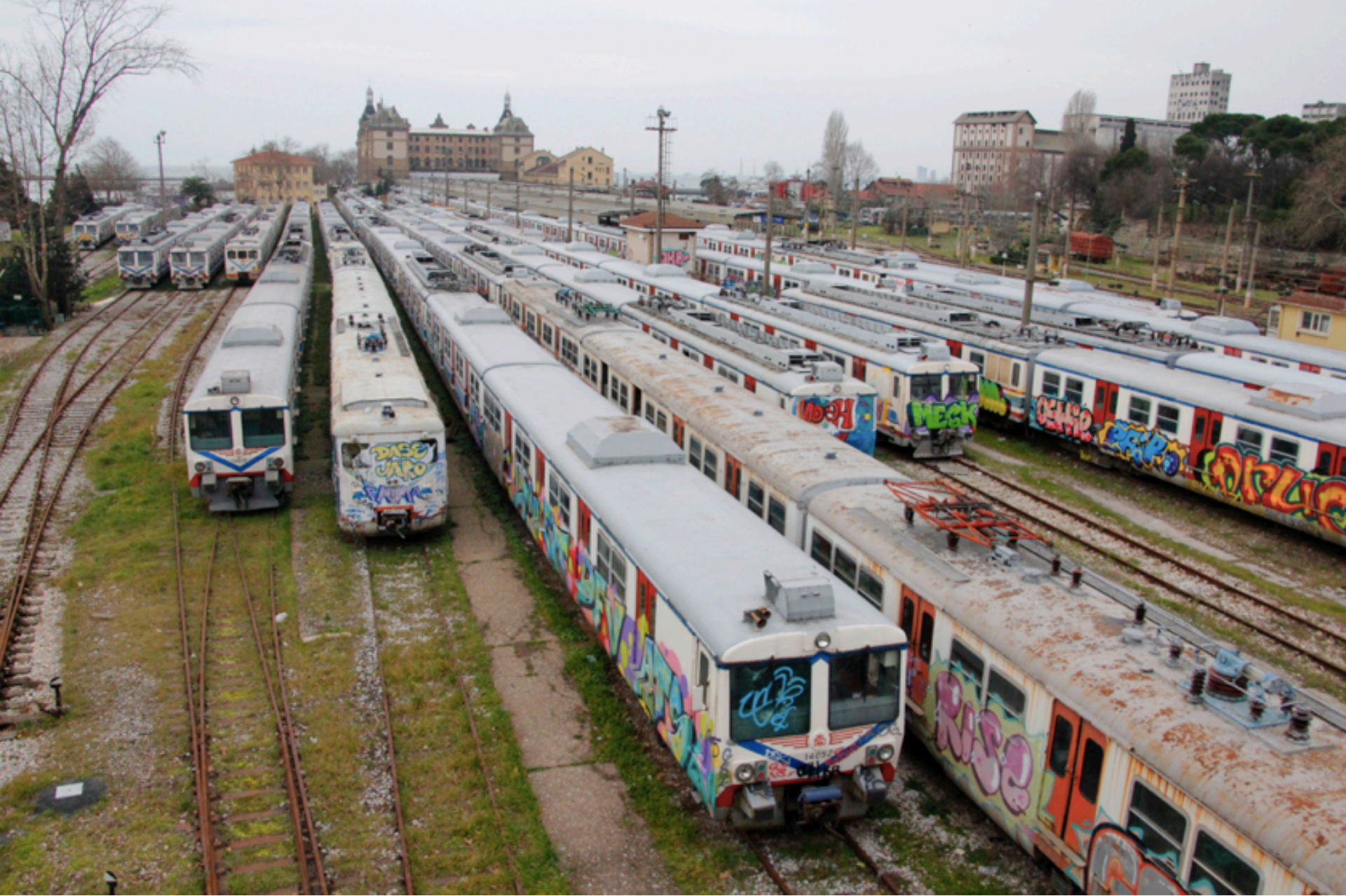
These trains go nowhere