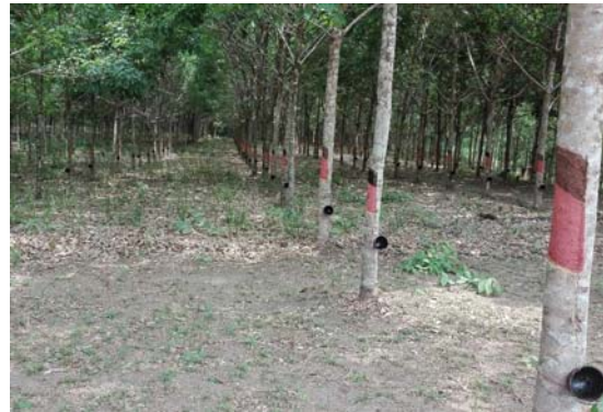
Pictures 3 and 4: Rubber plantations near Ein Da Rar Zar (these pictures were taken outside of Ein Da Rar Zar; a lot of rubber in the village cannot yet be harvested)

The land use change started to happen from the early 2000s onwards and increased after 2006 when the Myanmar Government expanded the rubber market. Although the villagers were not aware of this motive, they started practicing slash and burn in order to grow rubber due to its popularity. Gradually, the village attracted some outside investors; non-residential land buyers who also planted rubber on a small to medium scale. These outsiders are usually residents of nearby small towns such as Kan Pauk, only in very few cases they come from more distant places such as Yangon or other large towns in Myanmar. The rubber trees are in many cases still too young to be scratched. Some villagers and outsiders started to harvest the latex very recently, but most of the villagers can only start harvesting in the coming 1 to 3 years.