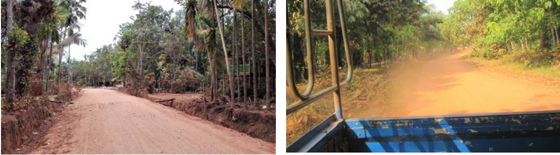
Pictures 9 and 10: The dust road in Ein Da Rar Zar (left;) and to Ein Da Rar Zar from Kan Pauk (right;)