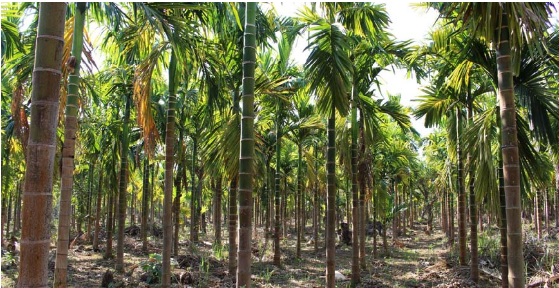
Picture 5: Betel nut plantation in Ein Da Rar Zar

Before it was betel nut plantation, the land was fallow land either with or without shifting cultivation on degraded forest land, and some parts were used as hillside cultivation for rice crops. Farmers had cleared some forest area to cultivate cash crops as well. The land was uncultivated for animal pasture such as cows and buffalos. The villagers depended on the forest products including – but not limited to – fruits, medicinal plants, bamboo, animals, and timbers. During that time, they always had to be afraid of armed groups such as the KNU Army, the Myanmar Army, and the Mon soldiers. 3