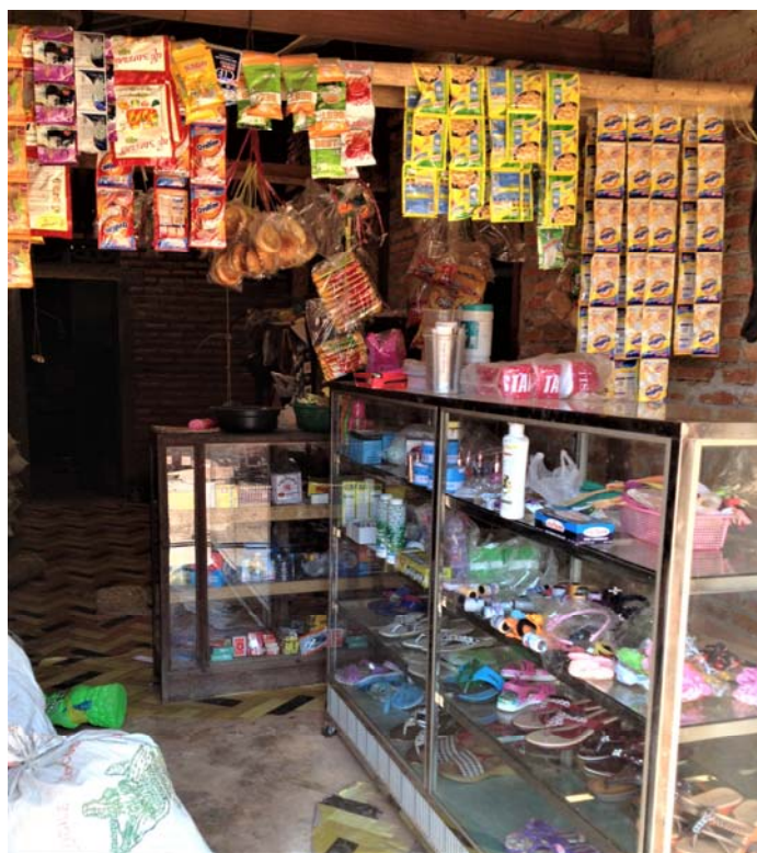
Picture 8: Shop in Ein Da Rar Zar; the villagers can only buy very few groceries, usually merely packed dry food and drinks.

Due to TOTAL's donations and Myanmar Government's efforts, the roads to Ein Da Rar Zar became more suitable for cars. Despite this positive development in transportation and therewith communication, the road built by the Myanmar Government (worth 80,000,000 MMK) is still very dusty and bumpy.