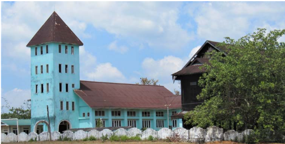
Picture 12: The new (left, in blue) and the old church (right, behind the tree) in Ein Da Rar Zar

The participants considered religion as improved because the Myanmar Government does not interfere with their faith anymore as it did 20 years ago. For instance, the Government will now easily grant the permission to build a church. Despite these positive changes, it is interesting to see men voted religion to be a challenging wellbeing aspect, the reason for which is unclear and would need further clarification.