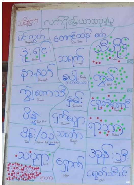
Picture 2: Rating of land uses in Ein Da Rar Zar village (by Win Myint)