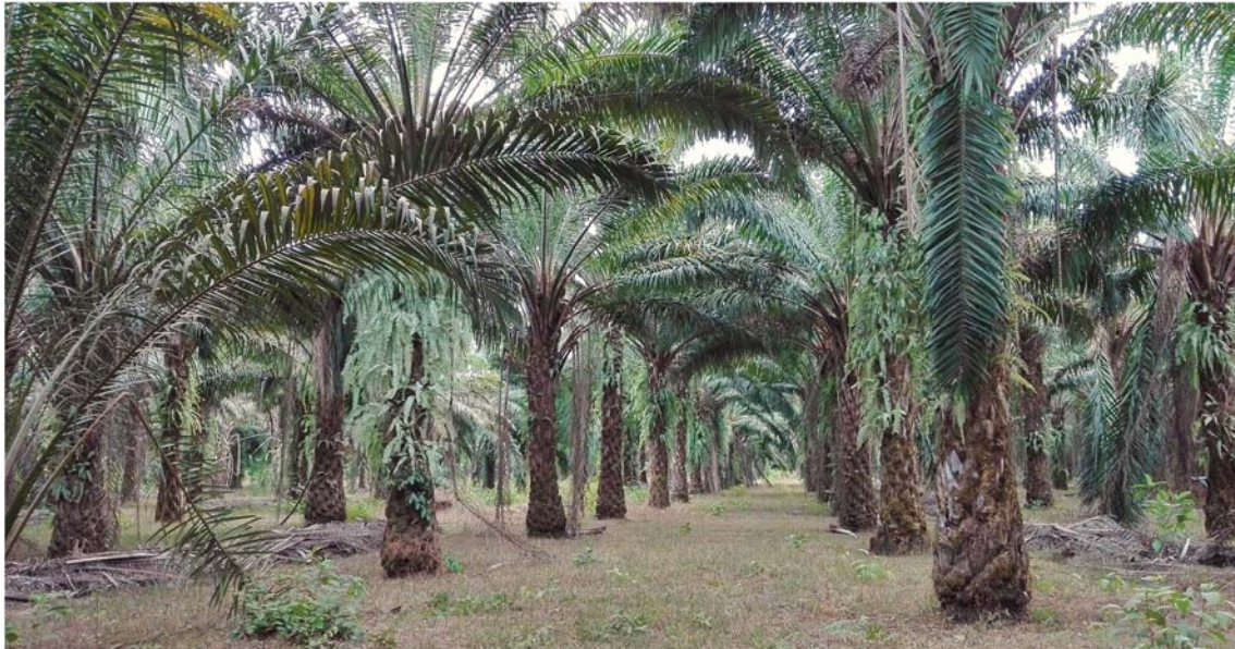
Picture 6: Oil palm plantation around Ein Da Rar Zar

Starting from 1997, some people, unspecified by the villagers, started clearing the land for two years. After the land had been cleared, the Myanmar Army occupied the land. Very high military officials and their relatives came to the village to declare the land as their own. Cashew nut cultivations of almost 800 acres 5 were taken over without compensation. This land was handed over to the company Skylink which then grew oil palms until 2002. In 2002, there were some political issues between Skylink and the Myanmar Government and Skylink was stopped. One or two years later, Myanmar Economic Holdings Limited (MEHL; Myanmar name is U Paing) received the cultivation permissions from Forest Department and took over the previously planted land from Skylink. Despite this change, the people involved were apparently the same. It is noteworthy that while Ein Da Rar Zar has been affected the most, nearby villages such as Ye Ngan, Shin Pyan, Maline Swae, and Sin Kuu villages were affected by such land occupation as well.