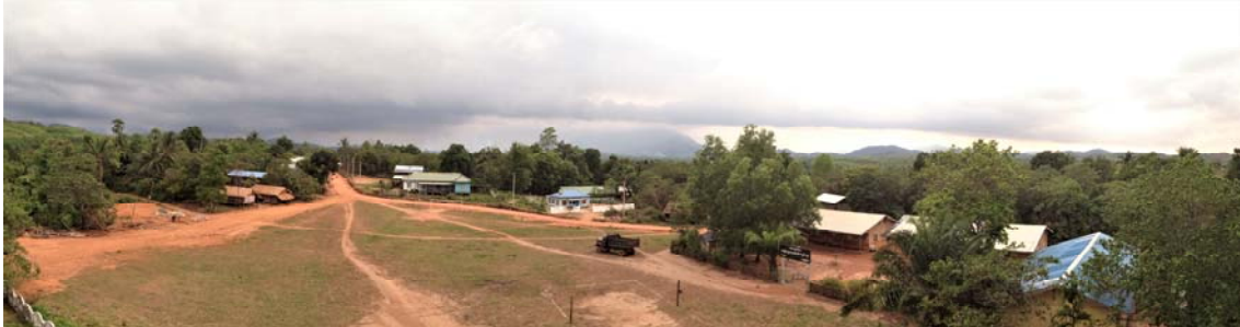
Picture 1: Ein Da Rar Zar village centre with a sports ground, the primary school to the left, and a small clinic in the back; picture taken from the church tower

Ein Da Rar Zar is on the one hand a village name and on the other hand the name of the village tract. Ein Da Rar Zar village tract encompasses six villages: Ein Da Rar Zar as the largest village, Shin Pyan, Ye Ngan, Sin Gue, Malain Swae, and Pyin Gyi. Kan Pauk / Mi Chaung Ain 1 is the nearest small town to Ein Da Rar Zar, where many people access the market.