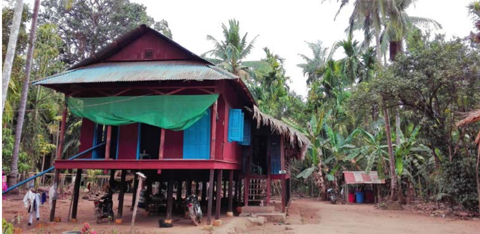
Picture 11: A typical house in Ein Da Rar Zar; nobody has any land ownership or land usership certificate yet

The participants considered religion as improved because the Myanmar Government does not interfere with their faith anymore as it did 20 years ago. For instance, the Government will now easily grant the permission to build a church. Despite these positive changes, it is interesting to see men voted religion to be a challenging wellbeing aspect, the reason for which is unclear and would need further clarification.