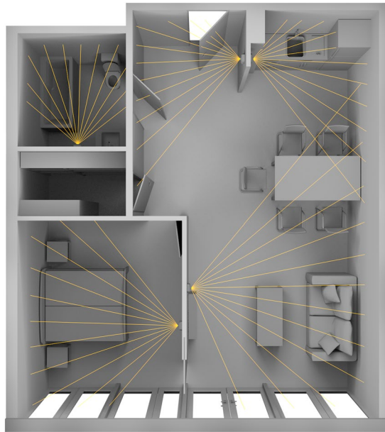
Figure 4. Exemplary apartment layout and PIR-sensor placement. Gives a broad idea of the kind of apartments we monitored and where the sensors were placed.

other studies that employed similar sensor setups 12,32,33 further confirm such a link between PIR-sensor measures and various health indicators and outcomes. Thus, PIR-sensor based assessment of physical activity could be a cost-effective and plausible approach for continuous, objective and unobtrusive long-term assessment of light- and moderate-intensity physical activity, which avoids the downsides of commonly used methods and bears the potential to aid in technology assisted healthy-aging.