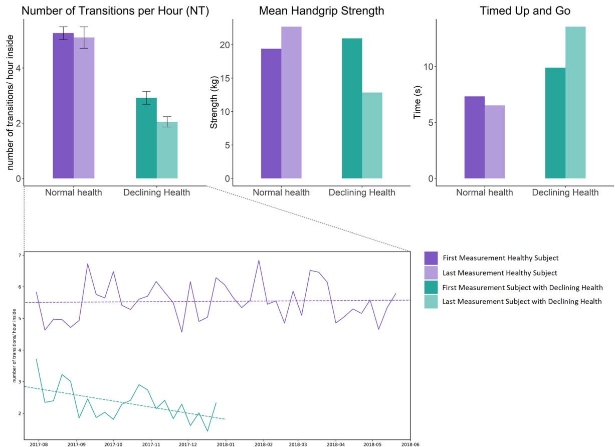
Figure 3. Comparison of first and last measurements of multiple assessments in a healthy subject and one with rapidly declining health (participant 11) and compares it with data from a healthy reference subject (participant 9). As such, the average in room-transitions of the first and last recorded month is displayed (left). In a similar manner, the handgrip strength (middle) and timed up and go (TUG) times (right) of the first and last assessments are shown. In all cases, for the subject with health issues there was a decrease in metrics (less room-transitions, less handgrip-strength, longer TUG times), while the healthy subject did not exhibit negative changes.

In addition, baseline physical activity evaluations, thus inter-individual comparisons will be difficult to extend to older adults with different apartment layouts. Note that this does not affect intra-individual physical activity changes and patient specific characteristics. However, based on our observations intra-individual change, if not induced by short-term illness (as for instance in the highlighted case study) has high variability and potential seasonal patterns, likely requiring data over multiple years to quantify less significant trends. Another limitation is that we cannot currently distinguish between multiple persons in the apartment, thus the method is only applicable for seniors living alone and who do not have frequent long-term visits that would significantly offset sensor readings. It is further not clear how the results would apply to similar aged populations with different local culture as the main assumption of this approach is based on the observation that Central European seniors spend a very significant amount of time inside their homes.