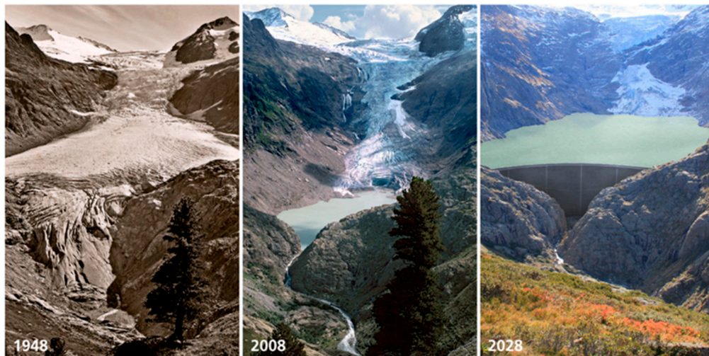
Figure 2. Planned hydropower dam at Trift glacier, Swiss Alps, with the glacier existing in 1948 (left), the proglacial lake existing in 2008 (middle), and with a full reservoir (right).

From 2008 to 2011, scientific actors have elaborated feasibility studies for the hydropower dam at Lake Trift as part of the large Swiss National Research Programme 61, titled ‘Sustainable water management’ [87]. Based on the results, KWO decided to drive forward the project at this location. Later, the canton of Bern initiated a feasibility study to determine the flooding-related and drought-related possibilities and limits of managing the Trift reservoir as a multi-purpose reservoir [88].