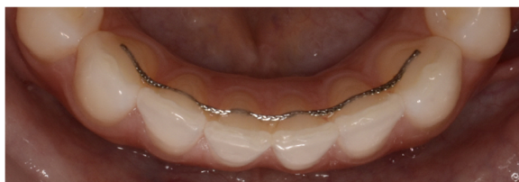
Fig. 2 .016" × .022" eight-strand braided SS wire (D-Rect., ORMCO) bonded to all 6 lower anterior teeth at T_3