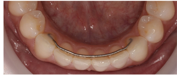
Fig. 3 .027" round TMA wire (ORMCO) bonded to lower canines only at T_3

(chipping within the composite—retainer still attached to the tooth but some composite necessary to recover the wire)