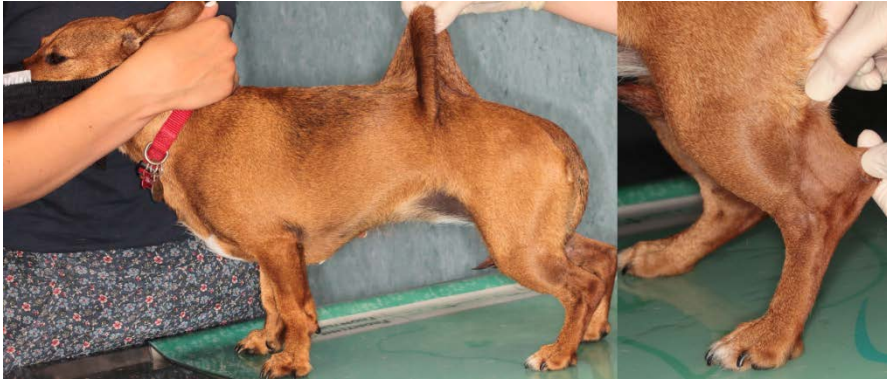
Figure 1. Mixed breed female dog with clinical signs of Ehlers-Danlos syndrome. Skin hyperextensibility is shown at different anatomical locations.