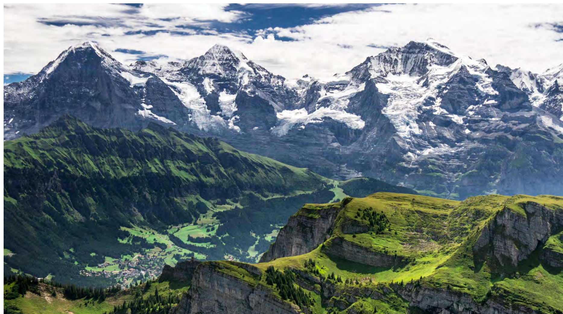
Three iconic mountains that are part of the natural heritage site Swiss Alps Jungfrau–Aletsch: Eiger, Mönch, Jungfrau.