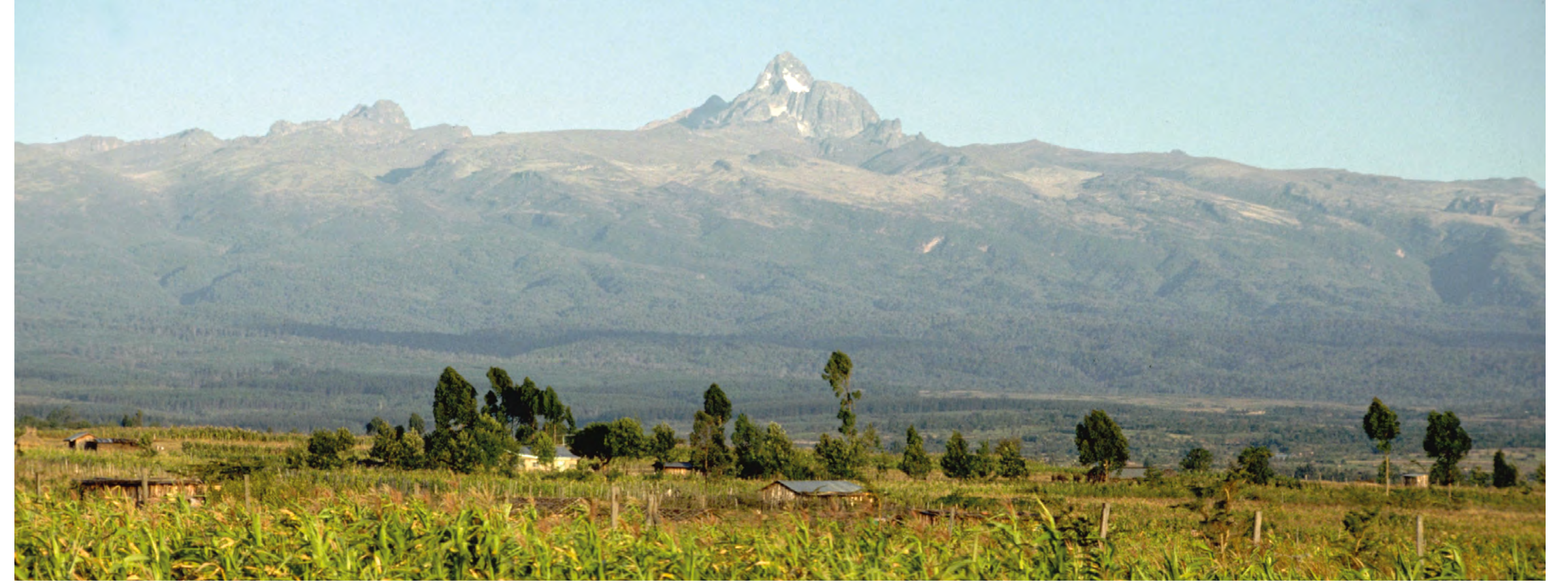
Mt. Kenya serves as a water tower for three agro-ecological zones.