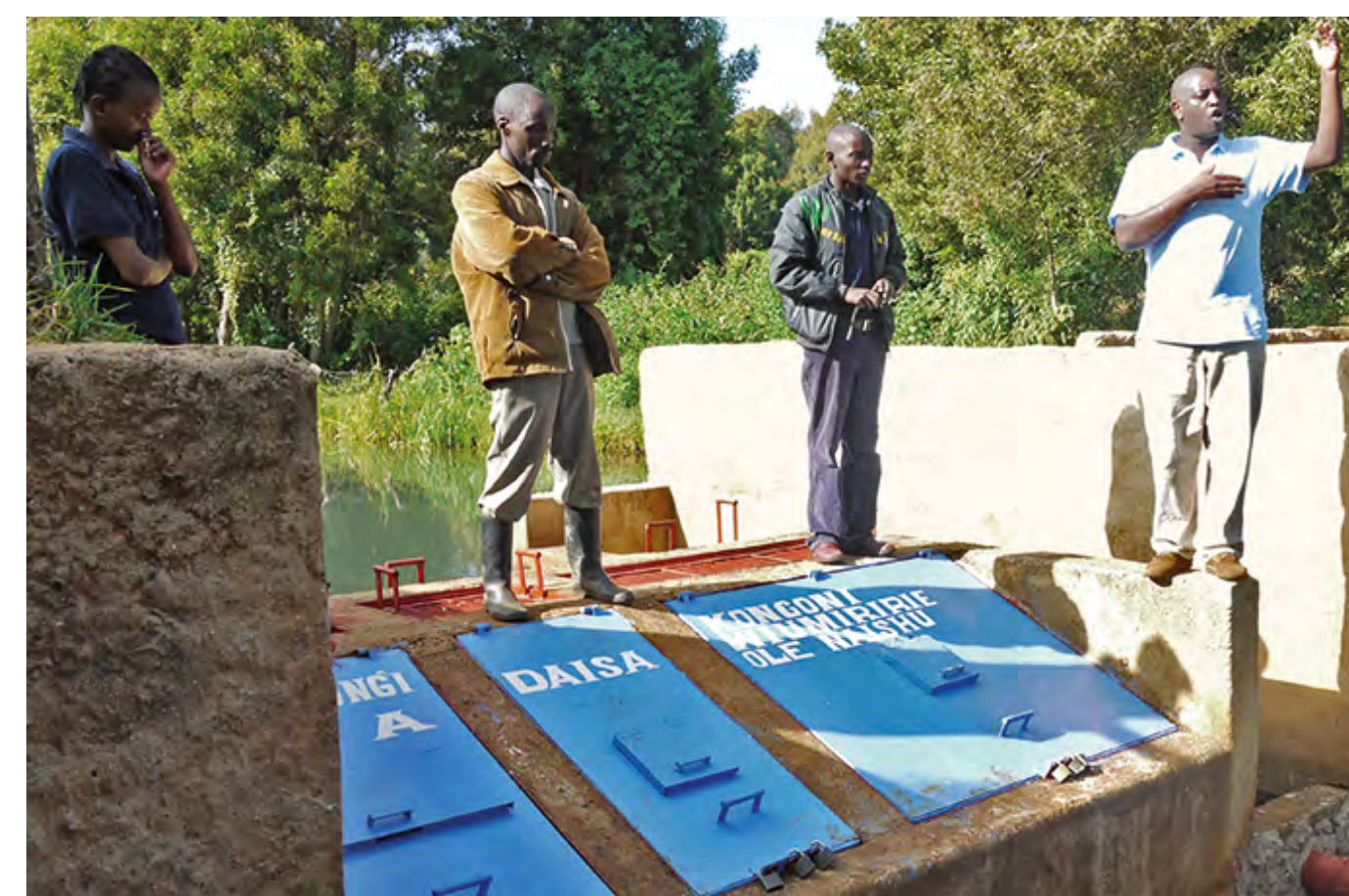
Members of a Water User Association in the Laikipia region, Mt. Kenya.