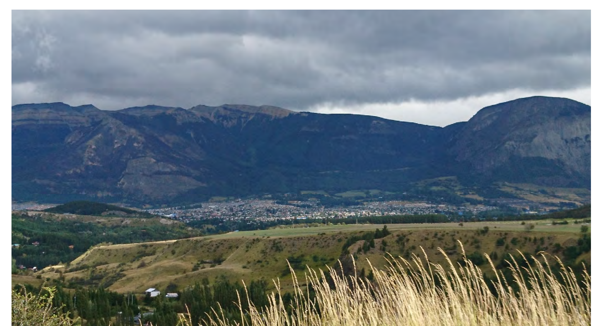
The town of Coyhaique, at the foot of a majestic mountainous nature reserve.