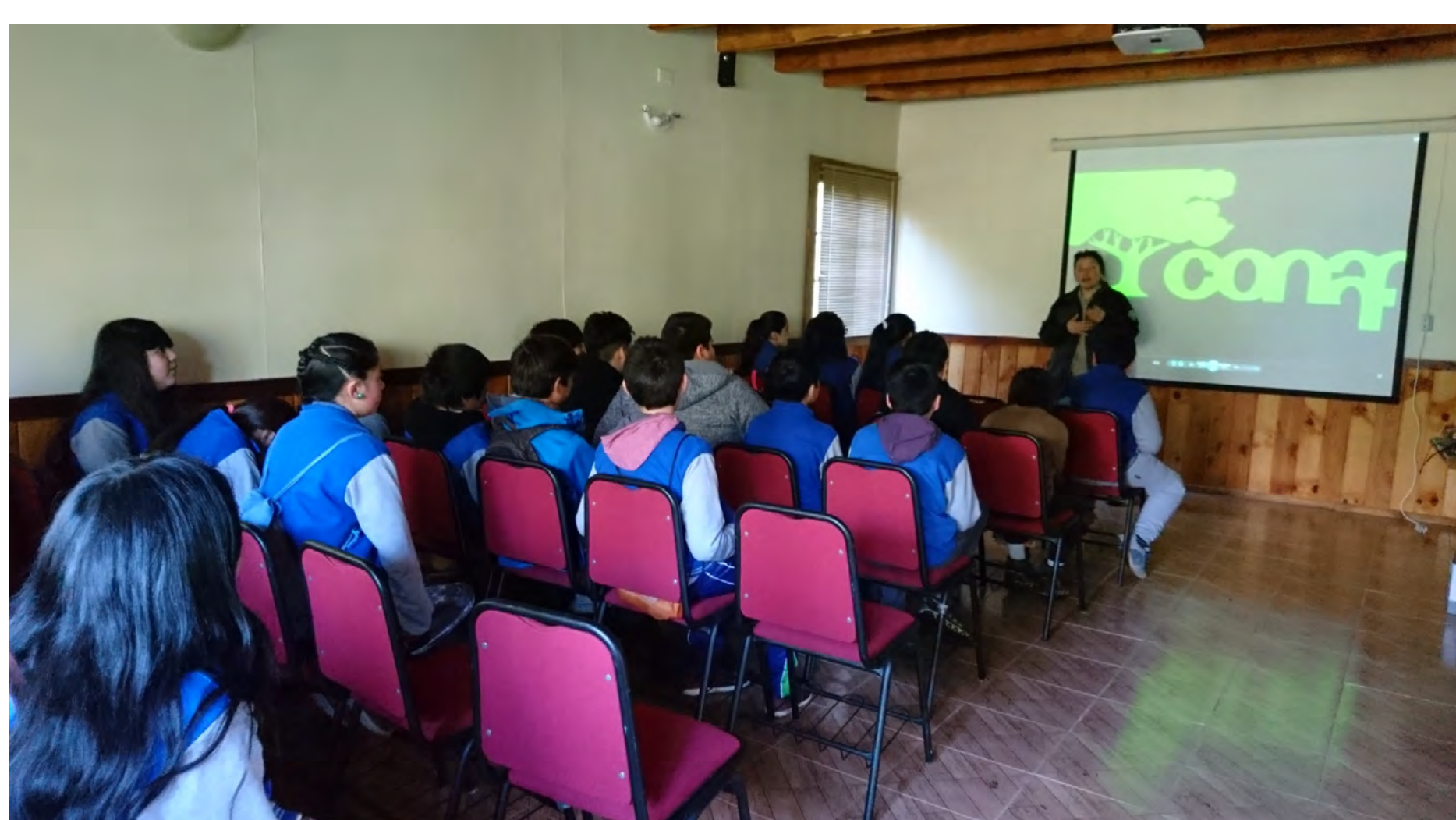
Pilot project for environmental education with a local school class in Coyhaique