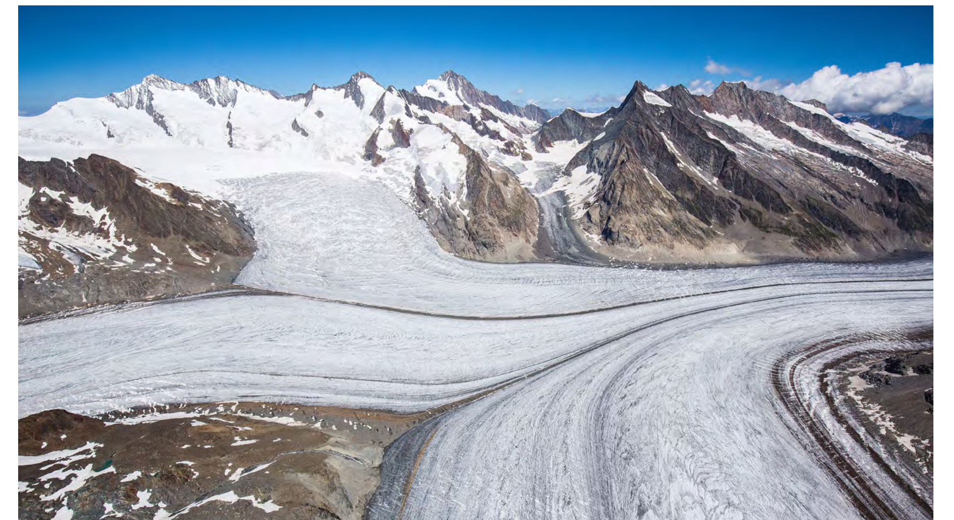
View of the dwindling Aletsch Glacier in Switzerland.