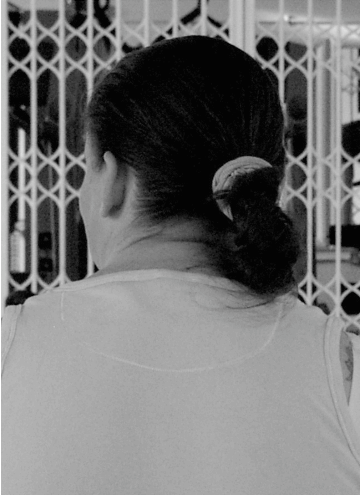
FIGURE 8: Facing bars