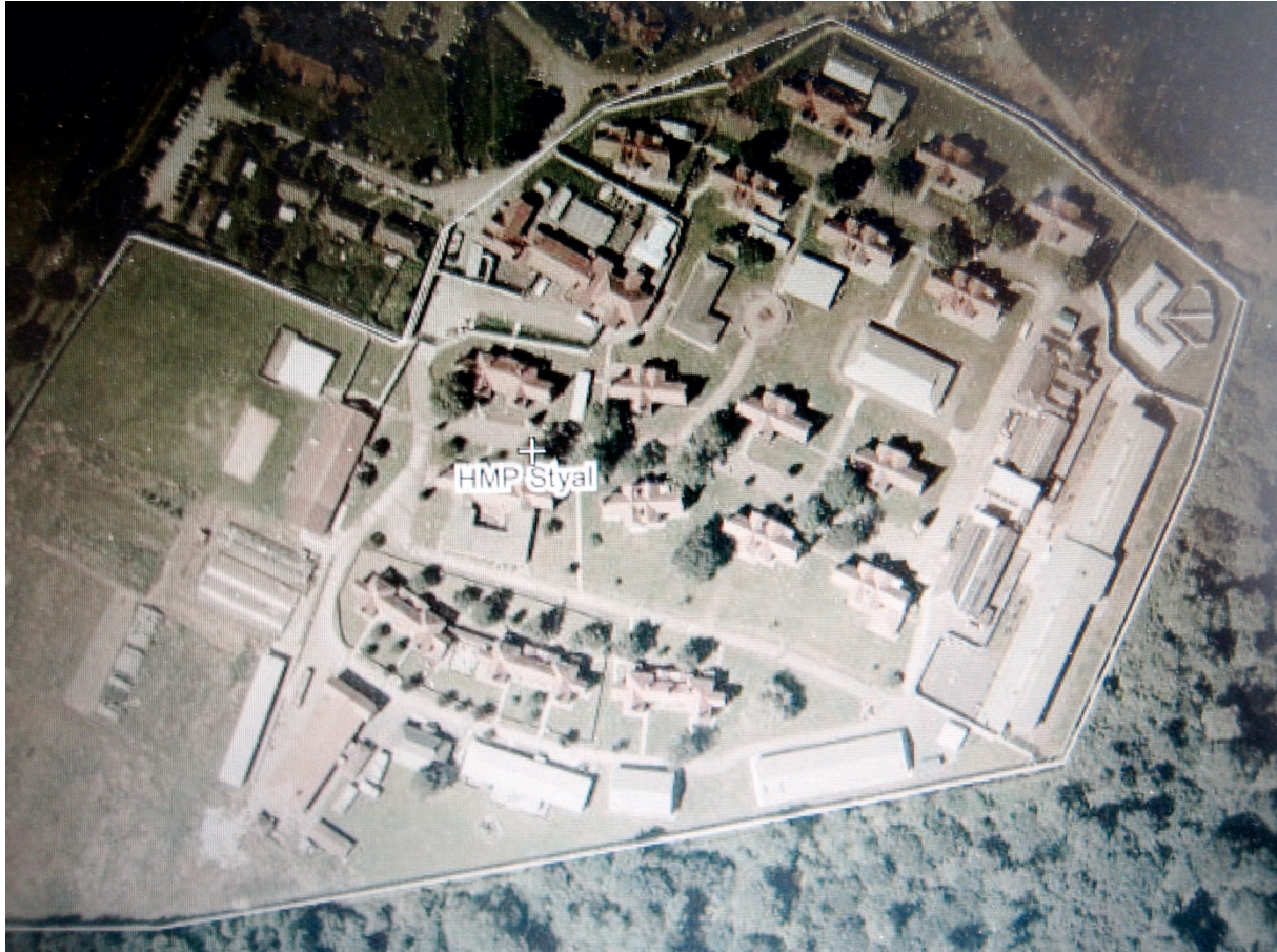
FIGURE 1: Birdview Styal Prison

For this project, our participants considered TIP's facilitators and me as part of the institution. We used the same entrance as people working in prison, but without the uniforms. A visitor's card made the difference and different to the officers, we were assumed to be there not to contain, but to entertain. The participants' motivation grew with the idea that expressing their experiences to us would contribute towards institutional change. And if that was too much to expect, they would still improve their prison record getting points for extra curricula activities. This was the basis for our dialogue.