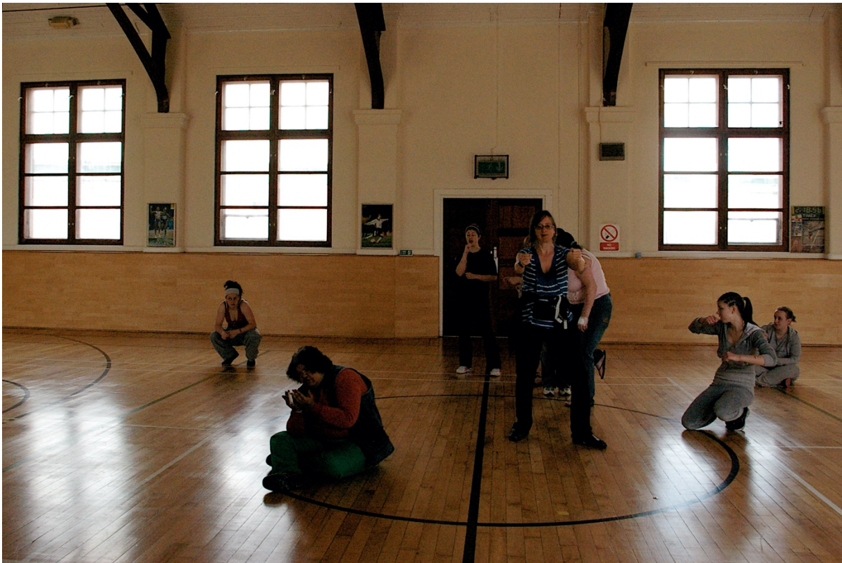
FIGURE 2: Applied Theatre Workshop with TIP