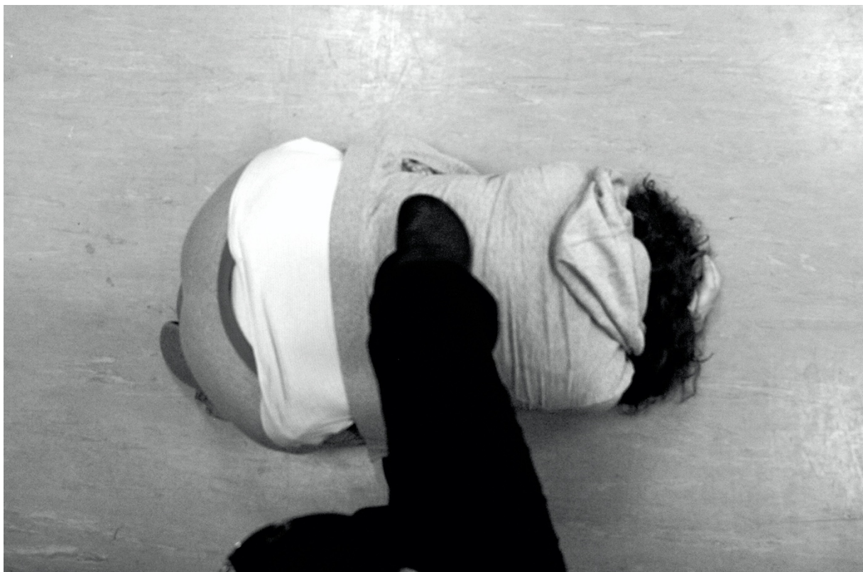
FIGURE 5: The system beats you