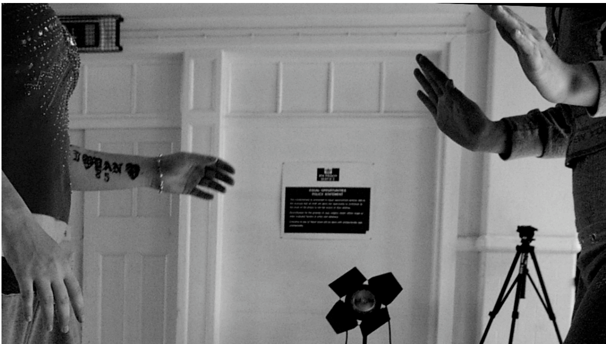
FIGURE 3: Fight and Defence