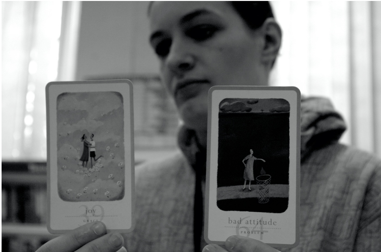
FIGURE 4: What's Me