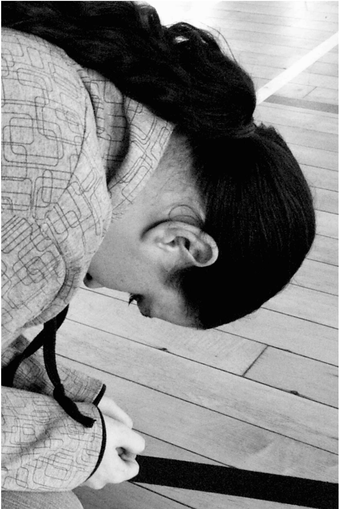
FIGURE 9: What to do