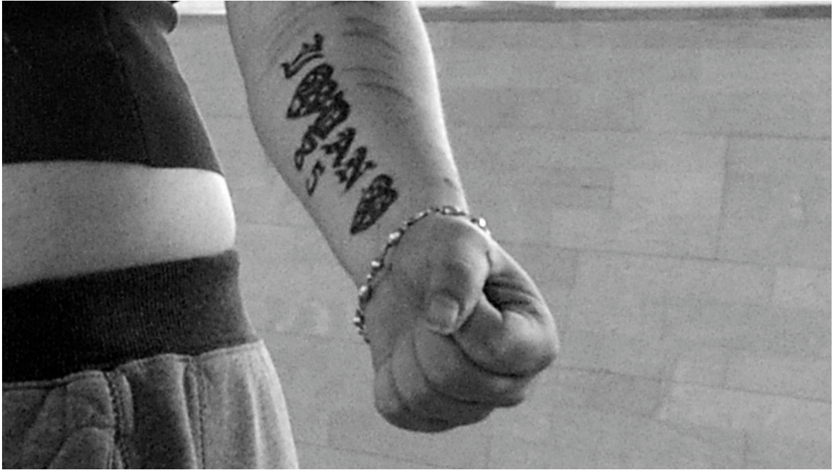
FIGURE 6: Feel yourself