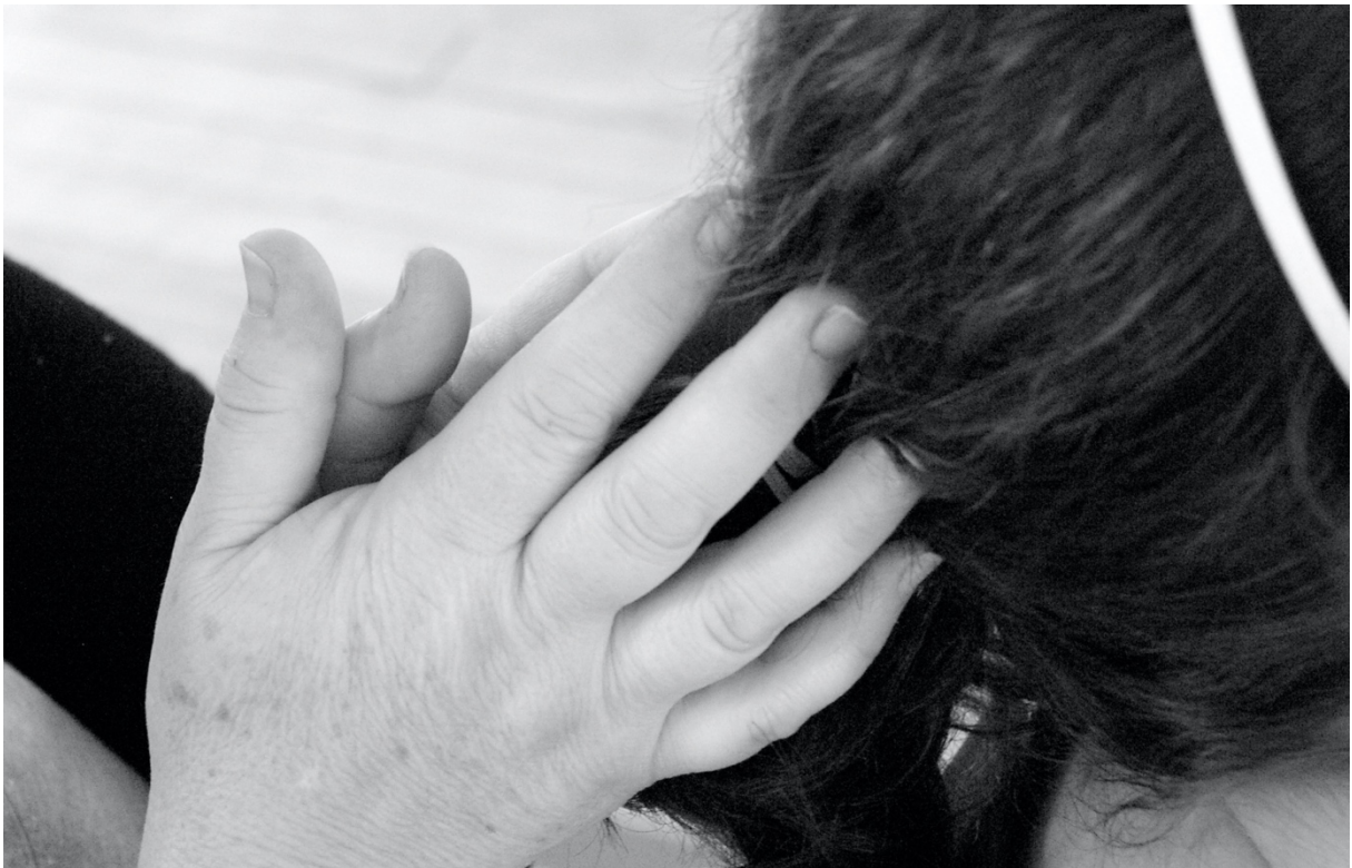
FIGURE 7: Togetherness