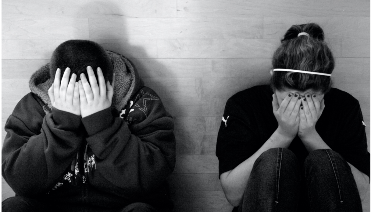
FIGURE 10: No title