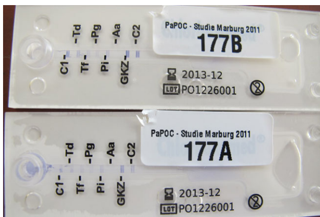
FIGURE 2 Picture of a test slide of CST