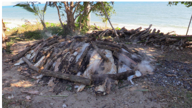
[tã], a ground oven