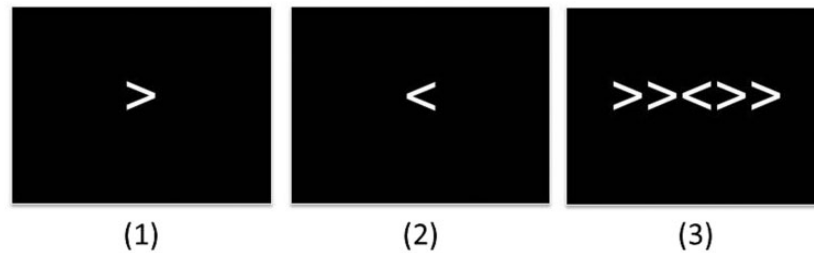
Figure 1. Examples for the simple RT condition (1), the choice RT condition (2), and the flanker RT condition (3) of the RT task.