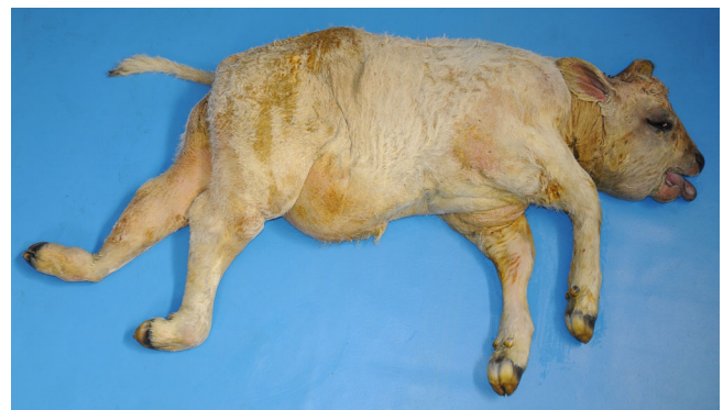
FIGURE 1 Stillborn Marchigiana calf showing multiple congenital anomalies. Note the shortened face and distended ventral abdomen resembling paunch calf syndrome reported in Romagnola cattle. Note the swollen hind legs and the right fetlock externally rotated

The affected calf had an enlarged head caused by a SC swelling that was especially evident in the periocular and the submandibular regions. The splanchnocranium was shortened and the frontal region asymmetric. The tongue was swollen and protruded from the mouth. The eyes were enlarged with evident scleral injection and conjunctival