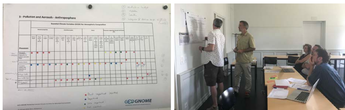
Picture 1. Left: An example of a poster filled by Anthroposphere Group with colored dots presenting the rated importance of an ECV (columns) for a specific process (rows). Right: Ecosphere Group discussing the rating of ECVs.

The resulting table of essential climate variables for mountain environments lists over 100 specific ECV products, which can be categorised under 45 ECVs (following the GCOS system). All these named ECV products are relevant for monitoring and understanding of at least one key mountain process. Land surface temperature, precipitation, albedo, snow cover, wind and water vapor were the ECVs that ranked most important for mountain processes across spheres. The existing GCOS list of global ECVs covers most of the selected variables but in-depth understanding of mountain specific processes requires also inclusion of new variables. Preliminary comparison with the ESA cci datasets, shows that for 39 of the considered ECV products some data is already available through the cci initiative. Further consideration of the data criteria (including required spatial and temporal scales) for each selected ECV is needed for a proper gap analyses for mountain specific data needs.