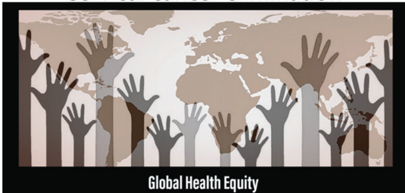
Photo: Internationally, progress towards cervical cancer elimination is unequal. This image was developed by the authors for this manuscript.

HIV/AIDS epidemic provides a compelling case study for today's global health issues and the discrepancies that exist. Similar efforts are now required to curb the unnecessary mortality arising from CC.