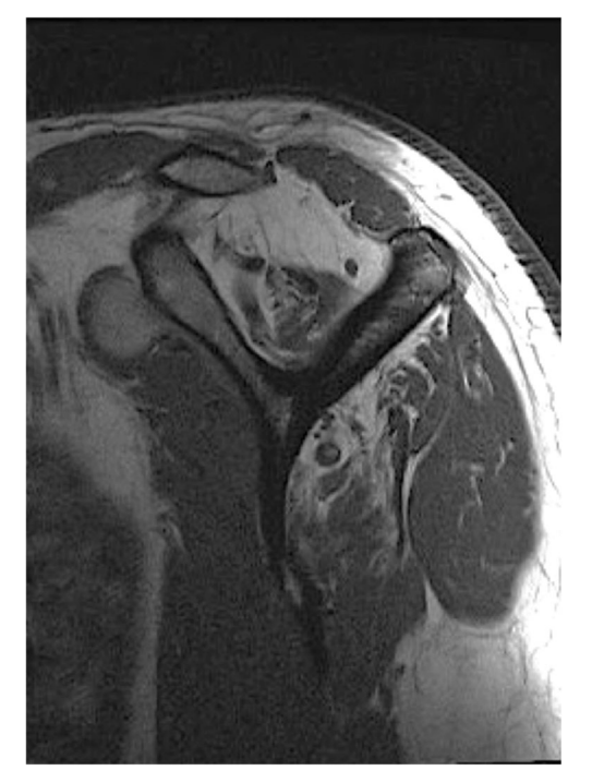
Fig. 1 Parasagittal T1-weighted MR imaging showing advanced fatty infiltration of the supraspinatus (with atrophy) and infraspinatus muscles. Muscles of the subscapularis and teres minor show no degeneration