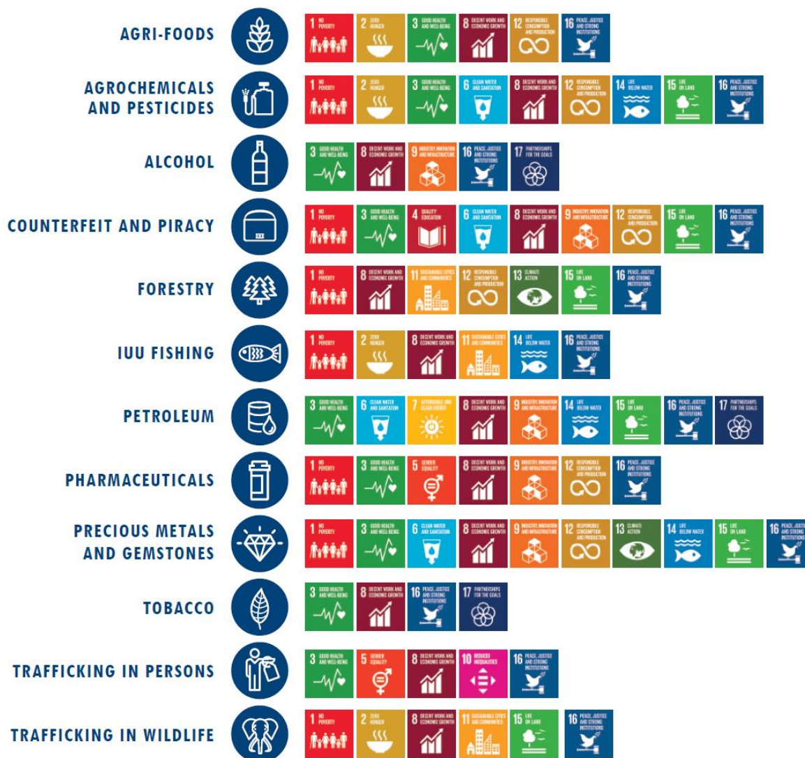
Table 1: Mapping illicit trade against the SDGs – TRACIT 2019

IFFs cut deeply across many SDGs and potentially threaten all 17 SDGs. In particular, IFFs associated with illegal trade – from wildlife poaching to human trafficking – impact the SDGs in many significant ways, as mapped by the Transnational Alliance to Combat Illicit Trade (TRACIT 2019). TRACIT findings highlight the interconnected nature of the challenge and point to difficulties in prioritizing policy response.