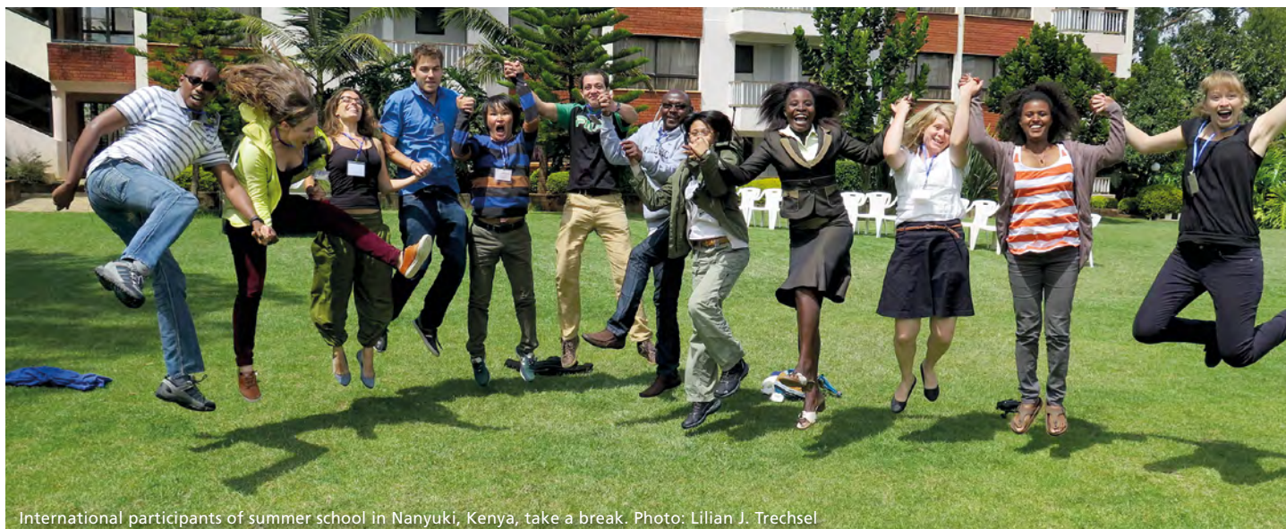
International participants of summer school in Nanyuki, Kenya, take a break.