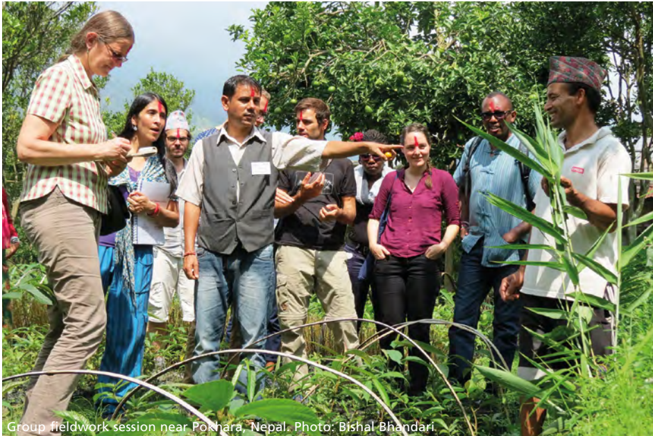
Group fieldwork session near Pokhara, Nepal.

“land grabs” and exploitation of workers, and its consequences, like economic refugees and reactionary politics.