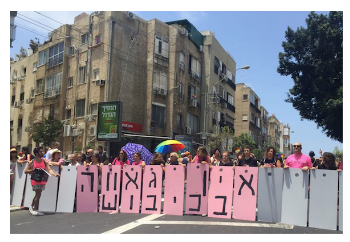
Figure 1. No pride in occupation Tel Aviv Pride 2017

In 2017, however, the bubble was momentarily punctured by a group of activists belonging to a variety of different organisations who teamed together to perform a protest against the yearly Pride parade. Standing behind a row of grey and pink panels with the slogan en gaava ba-kibuš ('there is no pride in occupation'), the demonstrators briefly stopped the incoming celebratory pageant before being pushed towards the sidewalks by the police and shouted at by the supporters of the right-wing party Likud (see also MAROM, 2017 for a media report on the event).