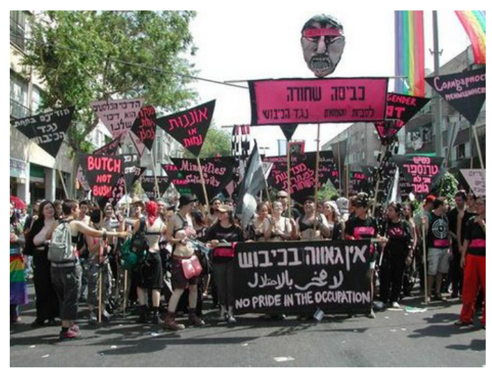
Figure 2. Black Laundry at Tel Aviv Pride 2002

Mashpritzot in 2013. Therefore, in order to fully grasp the political significance of the slogan and its affective layers in the context of Israel/Palestine, we first need to give a brief excursus of the historical role played by shame in Israeli queer radical movements, which though small in numbers "have continuously protested the occupation and exhibited solidarity with Palestinians" (ATSHAN, 2020, p. 122).