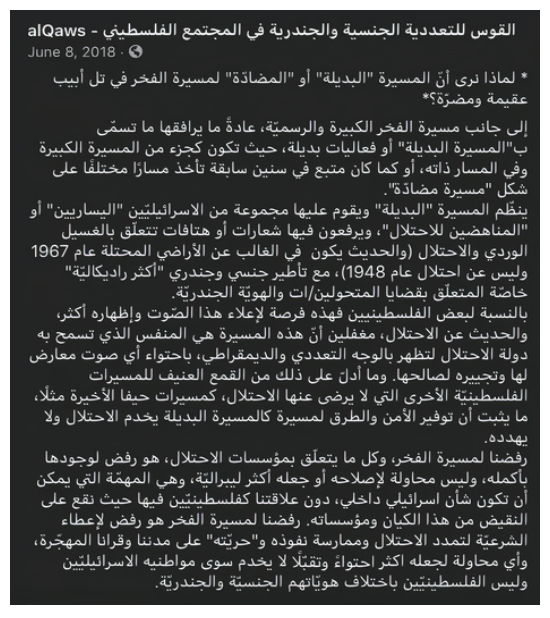
Figure 5. alQaws' Facebook post on Tel Aviv Pride 2018

On the basis of this, Atshan argues that "resistance to Zionism has increasingly taken priority over resistance to homophobia" (2020, p. 64). These fluctuations notwithstanding, alQaws has been adamant to emphasise the impossibility of joining forces with queer Israeli radical movements. The impossibility of a queer alliance between Palestinian and Israeli sexual activisms is encapsulated most forcefully in a Facebook post published by alQaws in the context of Tel Aviv Pride 2018.