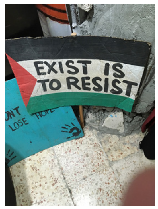
Figure 7. Sign taken at the museum at the Walled Off Hotel in Bethlehem

he transforms the material reality of the checkpoint into a counterpoint in Said's understanding of the term: simultaneously a memento of the reality of the Palestinian present and a material vantage point from which to perform resistance, imagining the possibility of a completely different world.