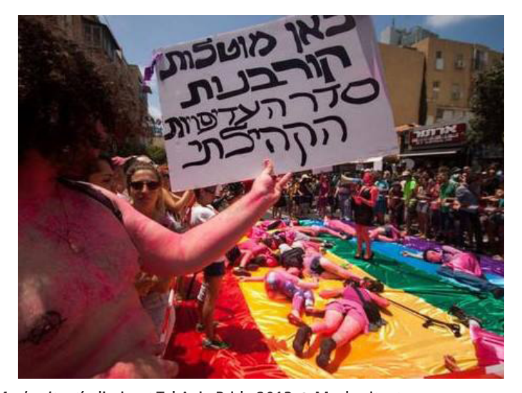
Figure 3. Mashpritzot's die-in at Tel Aviv Pride 2013