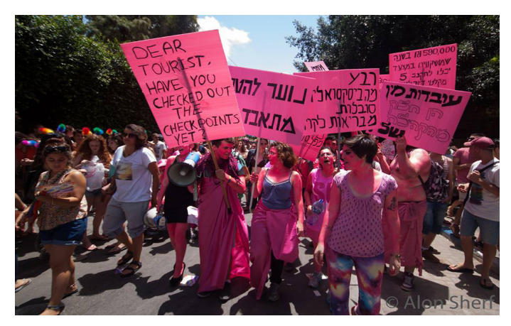
Figure 4. Mashpritzot's protest at Tel Aviv Pride 2013