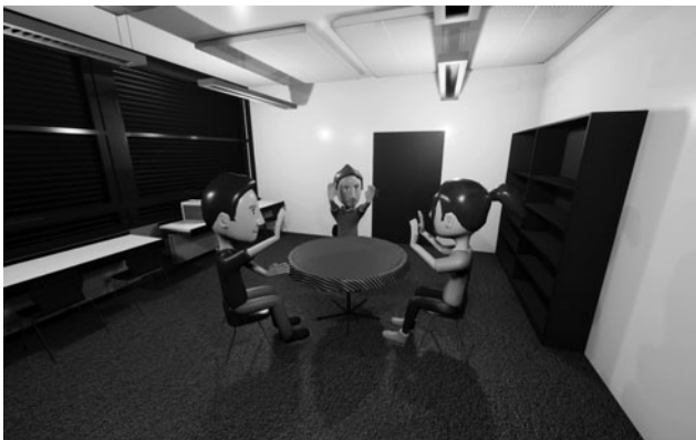
FIG. 1. Three participants represented by virtual representatives (i.e., avatars) engaging in the group discussion.

The avatars were seated at a virtual table, which did not allow full-body movement. However, the avatars could move their head in sync with the HMD and their hands were tracked by hand controllers of the HTC Vive. Elbow position was computed by an inverse kinematics script of the Unreal Engine. Voice input to the microphone was managed by the Ultimate Voice Chat (Octagon Interactive Ltd.) plugin for the Unreal Engine. The auditory input was spatialized to mimic the spatial setting of the avatars (distributed equidistant around the table). Furthermore, signals from the mi-