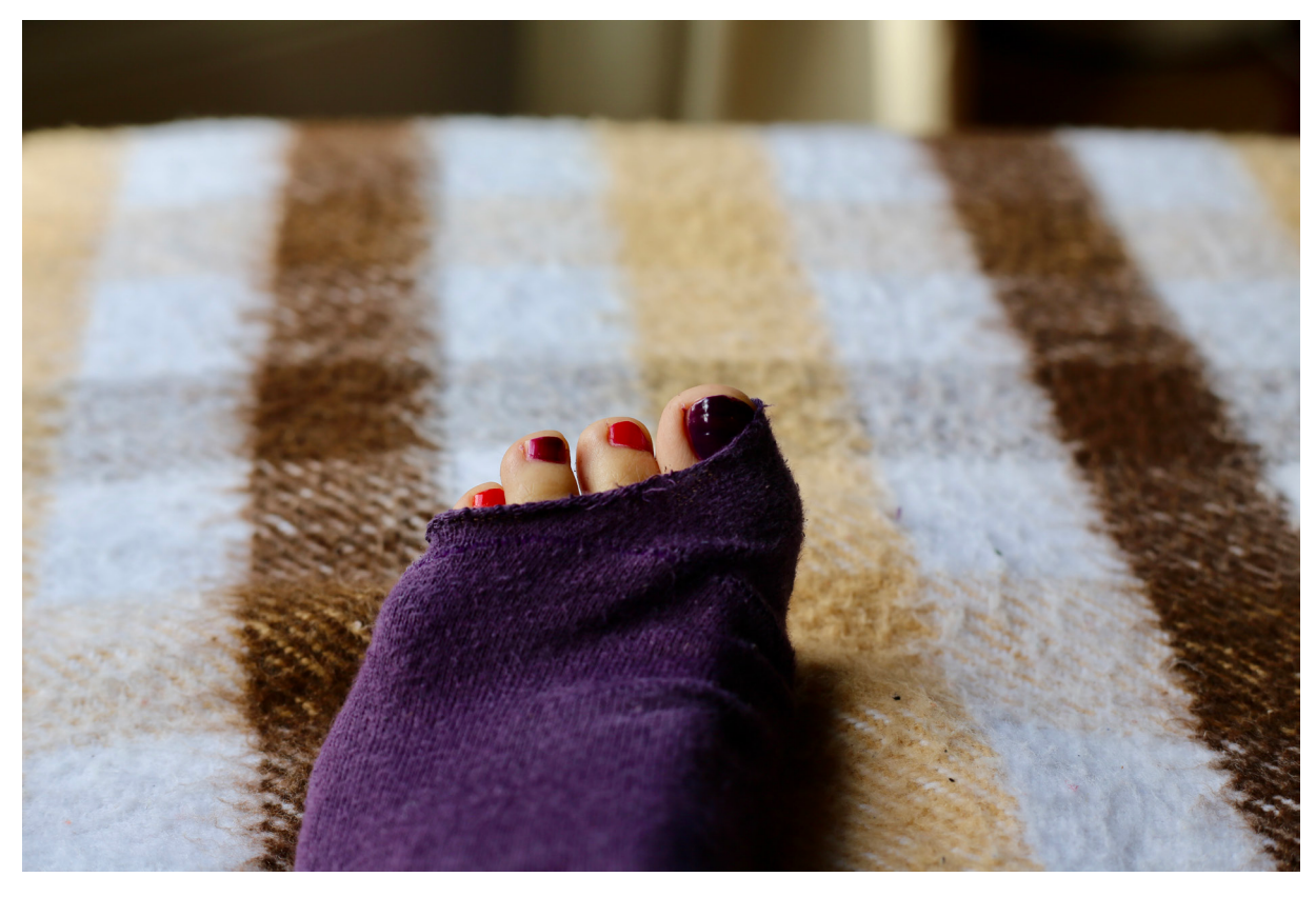
Figure 2. Joyful neglect or painted toenails in ripped sock