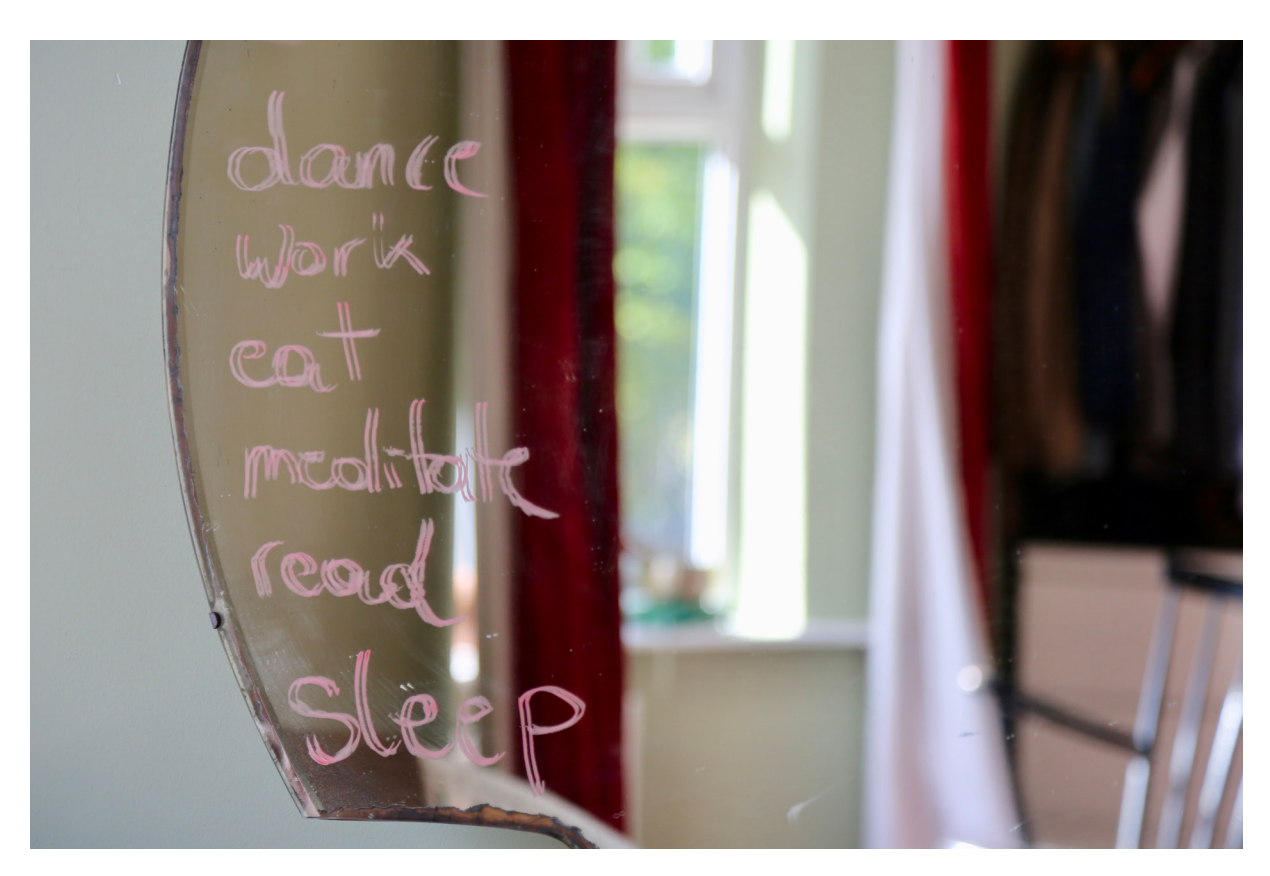
Figure 1/ Tactics or activities written in a mirror.