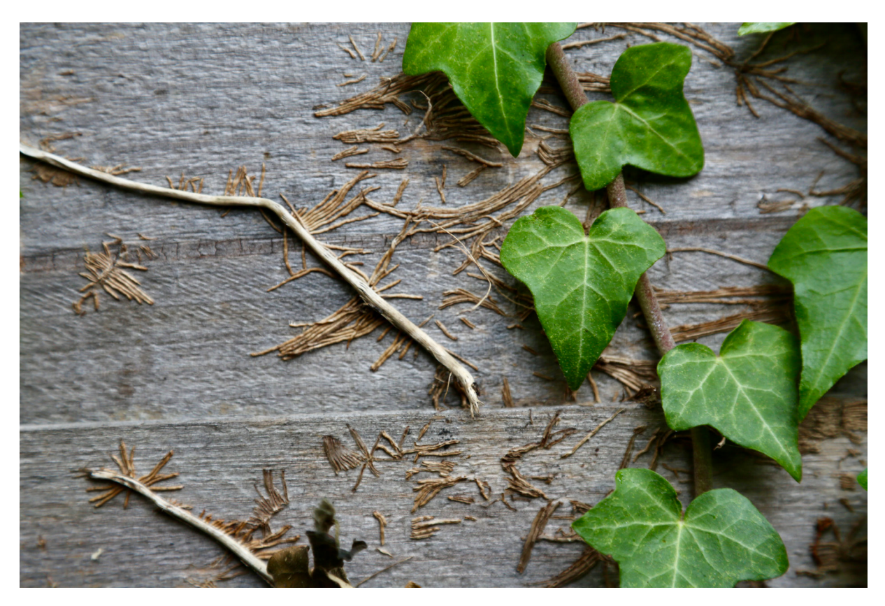
Figure 9. Attachments or ivy on my garden fence.