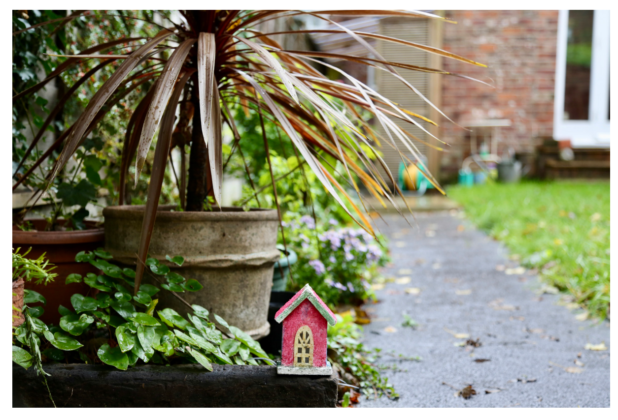
Figure 10. House of fairies or toy house.