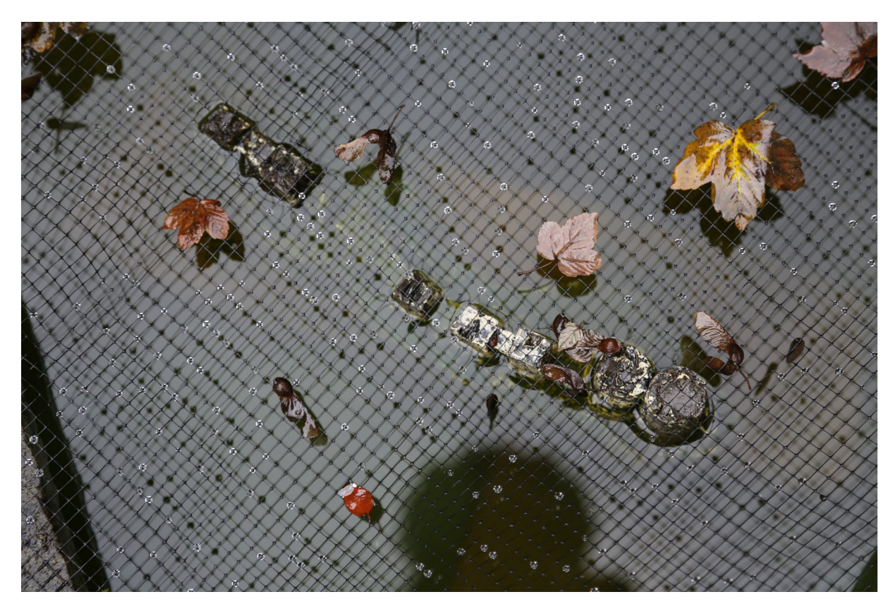
Figure 3. Metaphors or drops of water caught in net.