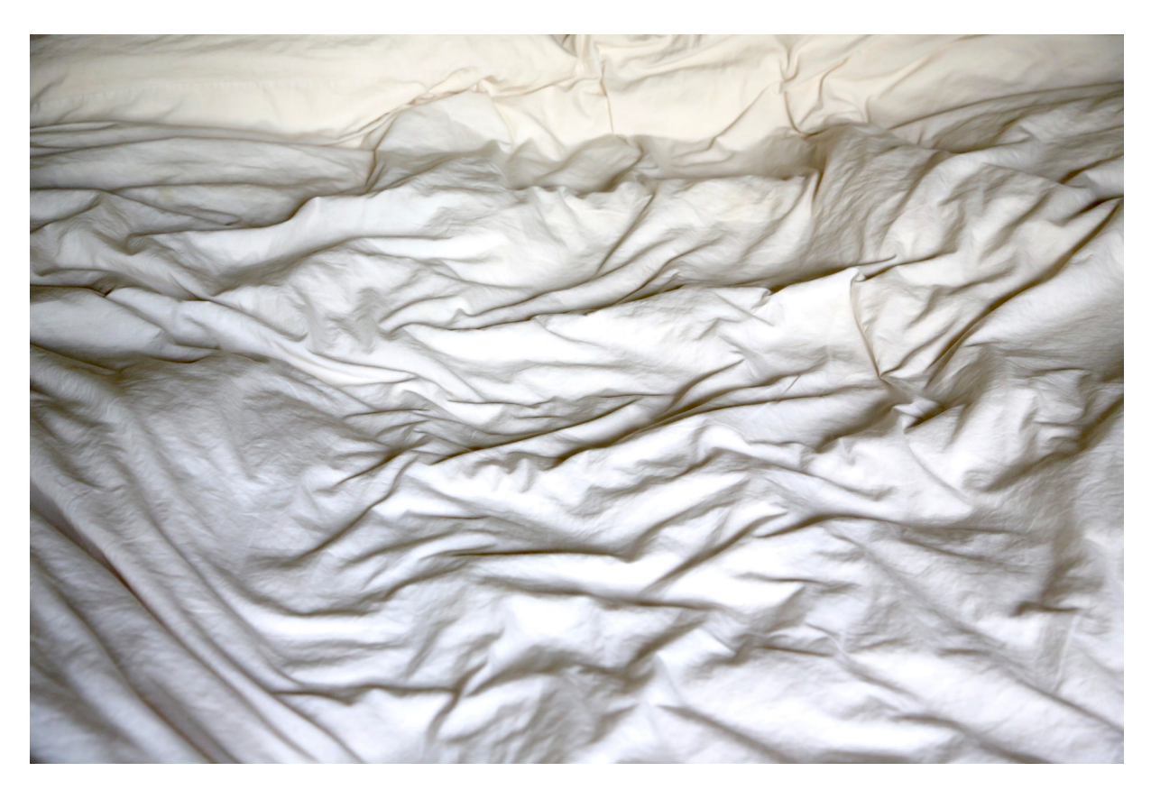
Figure 7. A sea of bed or bed sheets in the morning.