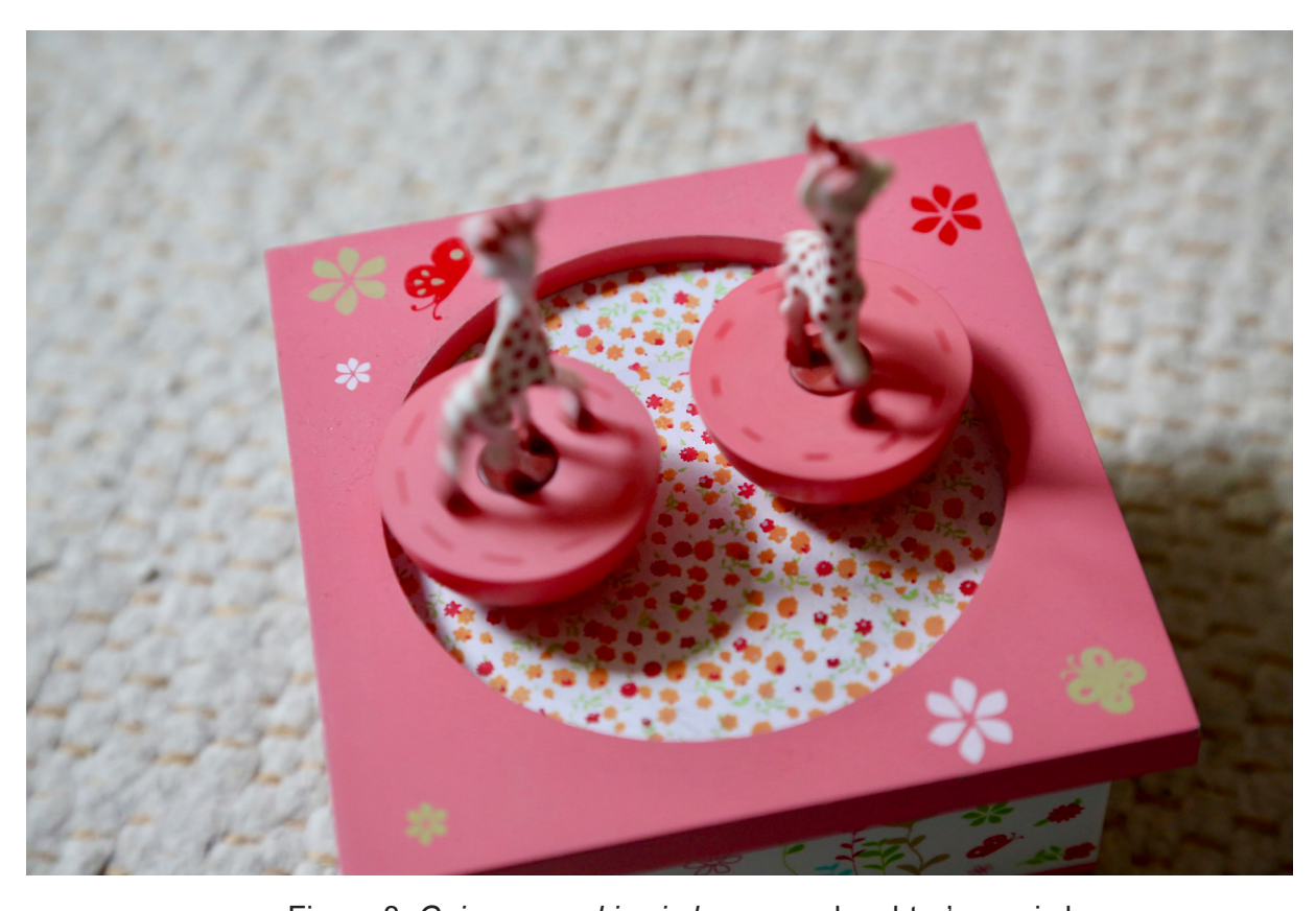
Figure 8. Going around in circles or my daughter's music box.