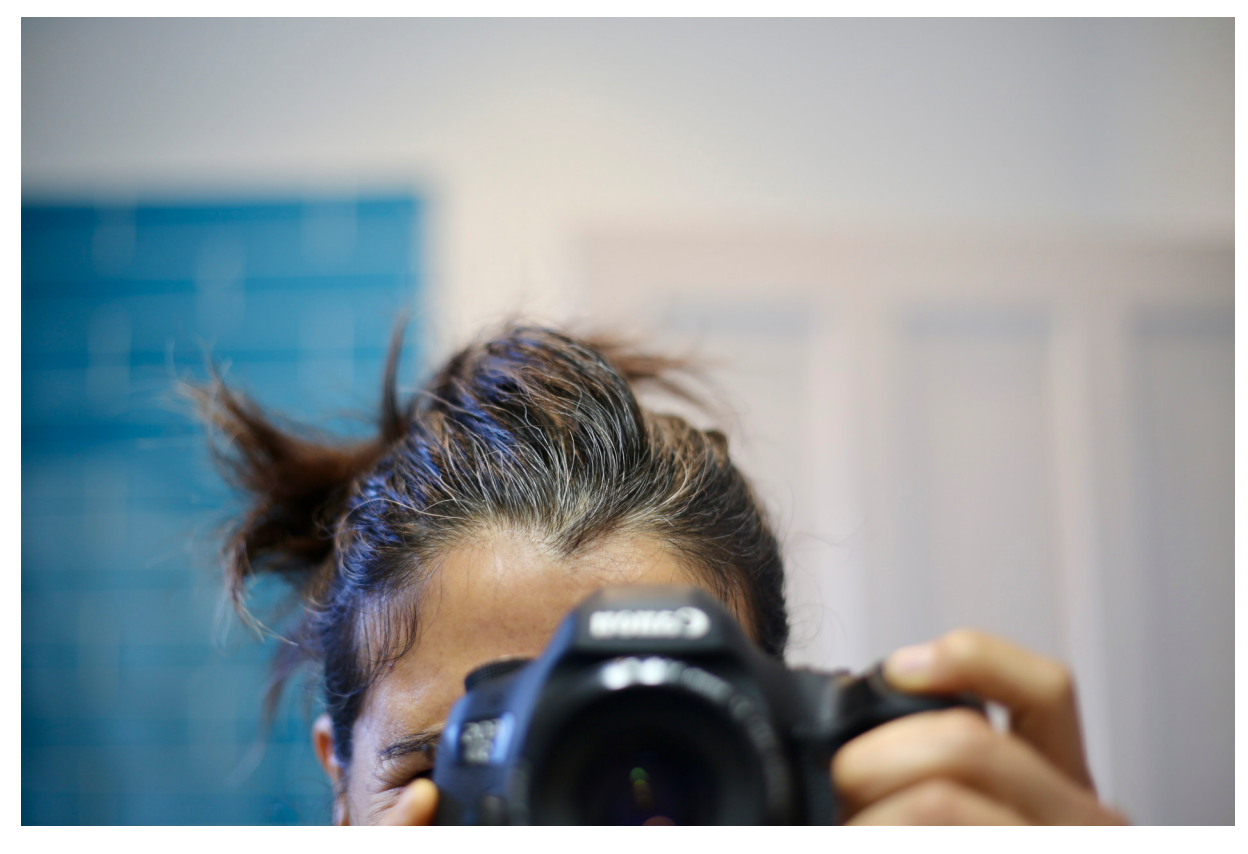
Figure 4. Fading colours, or a picture of my hairline.