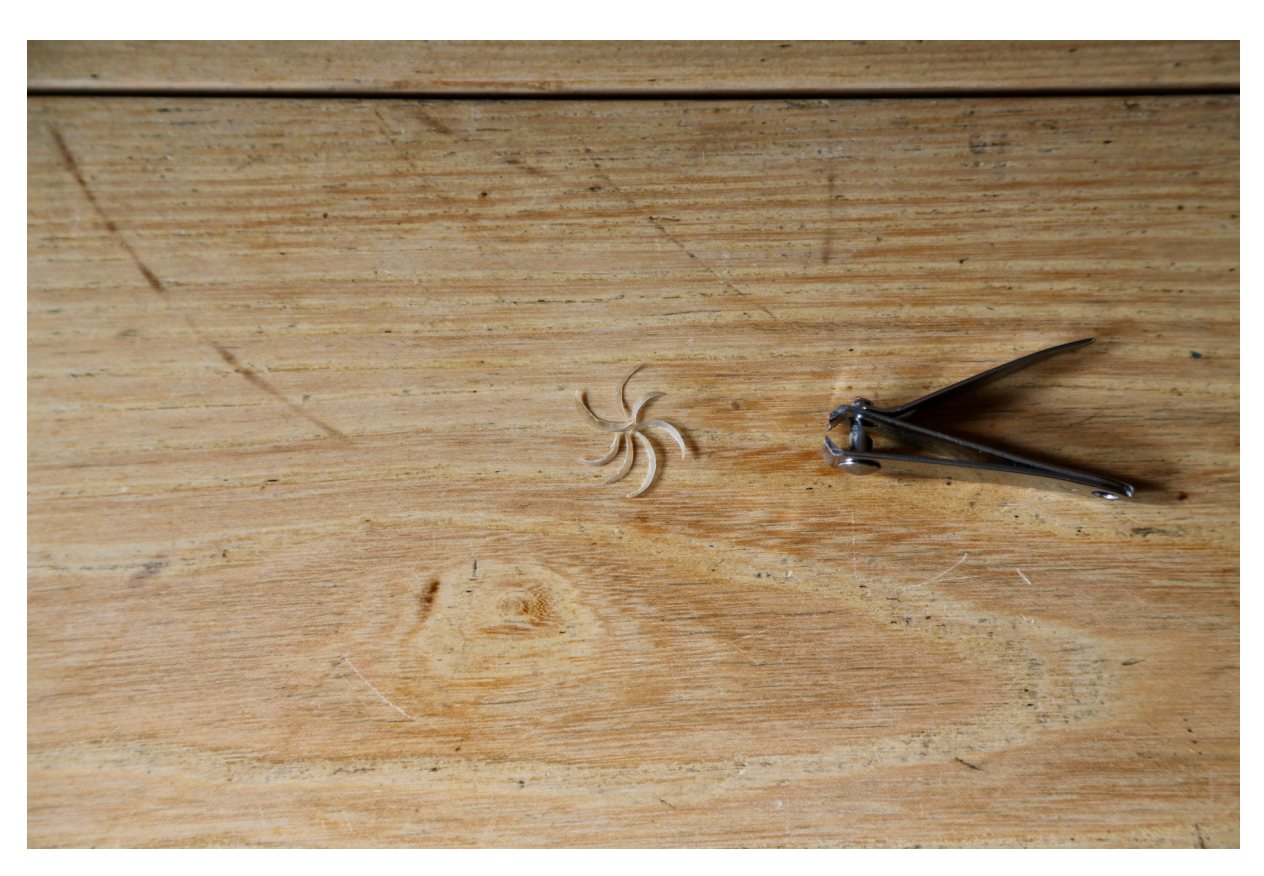
Figure 5. Rethinking the mundane or nails arranged in star shape next to nail clipper.