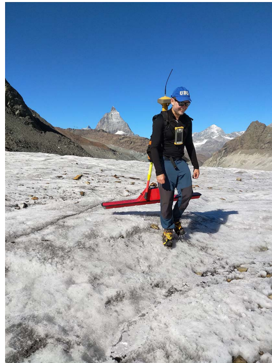
FIGURE 3 GPR measurements on the Gorner Glacier, near Zermatt, Switzerland, on 25 September 2018 (Box 2). The renowned Matterhorn (4478 m above sea level) appears in the background. Data from these measurements were analyzed under the frame of a seed funding project of CIRM.

(deep) integration of heterogeneous scientific and nonscientific points of view into collaborative research that contributes to the sustainability of mountains. Facilitation and other methodological approaches (eg common research site, codesign) were found to be very valuable, but our results also revealed that such integration was perceived to be related to a multidimensional transformation. While a clear gap identified in the literature is how inter- and transdisciplinary research can support societal transformations in mountains (Huber et al 2013; Martín-López et al 2019; Schneider, Giger, et al 2019), our experience adds that the operationalization of this research requires a transformation of the researchers. This finding resonates with Schneider, Giger, et al (2019), who reported that one of the mechanisms by which transdisciplinarity may generate social impact is the acquisition of embodied competences and knowledge in collective processes of self-transformation. This suggests that research centers should not only provide training on integrative methods (ie across the natural and social sciences) and facilitation techniques, but also on self-transformative procedures. Different techniques, like cognitive training or meditation, have been tested in organizational learning and management studies (CEL 2017). We thus propose that they should be applied and that their transformative potential should be systematically evaluated in self-reflexive mountain research centers.