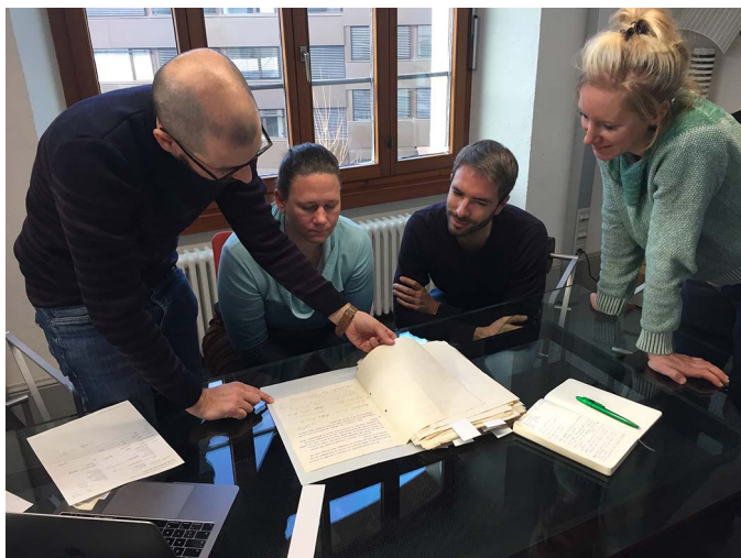
FIGURE 4 Postdoctoral workshop of 22 January 2020 at the Valais State Archives in Sion, Switzerland (Box 3). A historian (first on the left) shows to the natural scientists how to search and analyze archival data for mountain research.

policy toward a stronger support for inter- and transdisciplinarity (Taylor and Krause 2004; Sheate et al 2008; Björnsen Gurung et al 2012; Gleeson et al 2016). Thus, the criteria used to evaluate applications for academic positions and research projects should be revised at the level of research centers, universities, and national and international funding schemes.