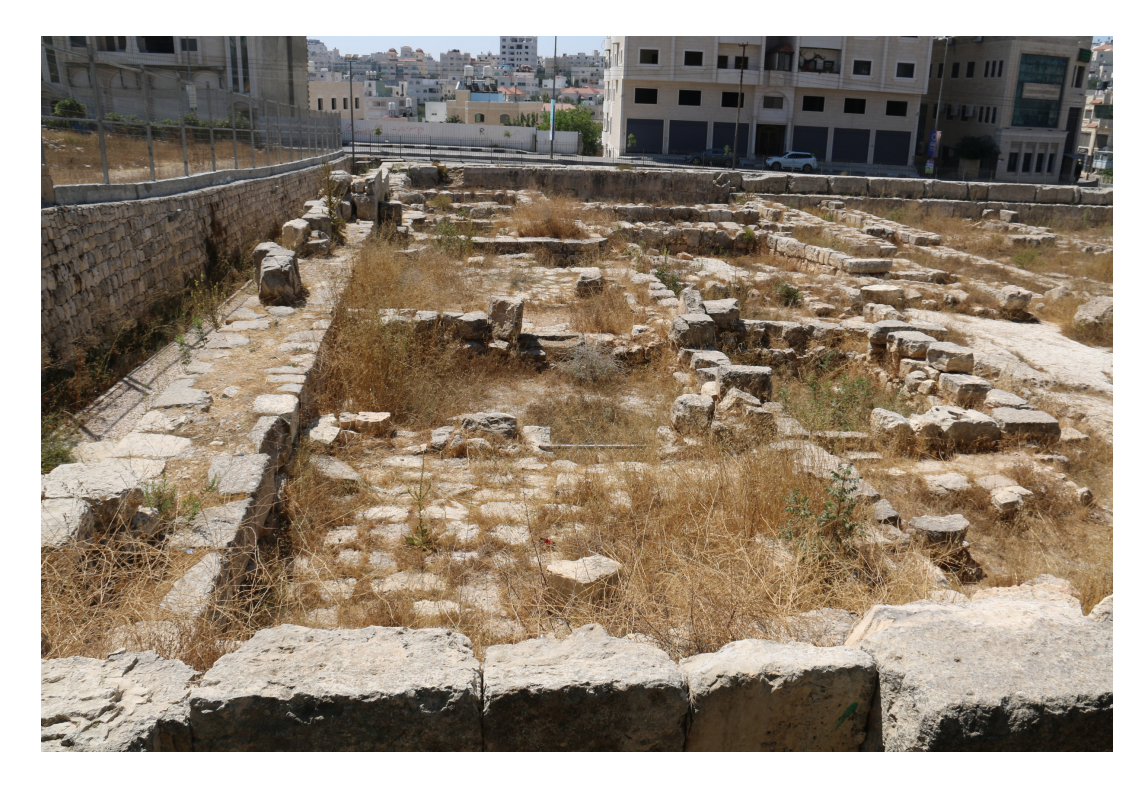
Figure 3 View from northeastern corner over the Constantinian structures. In the foreground, the "living rooms" of Abraham and Sarah. The large cubes of the enclosure wall at the lower edge of the picture are typically Herodian (photo: Katharina Heyden 09/2019).