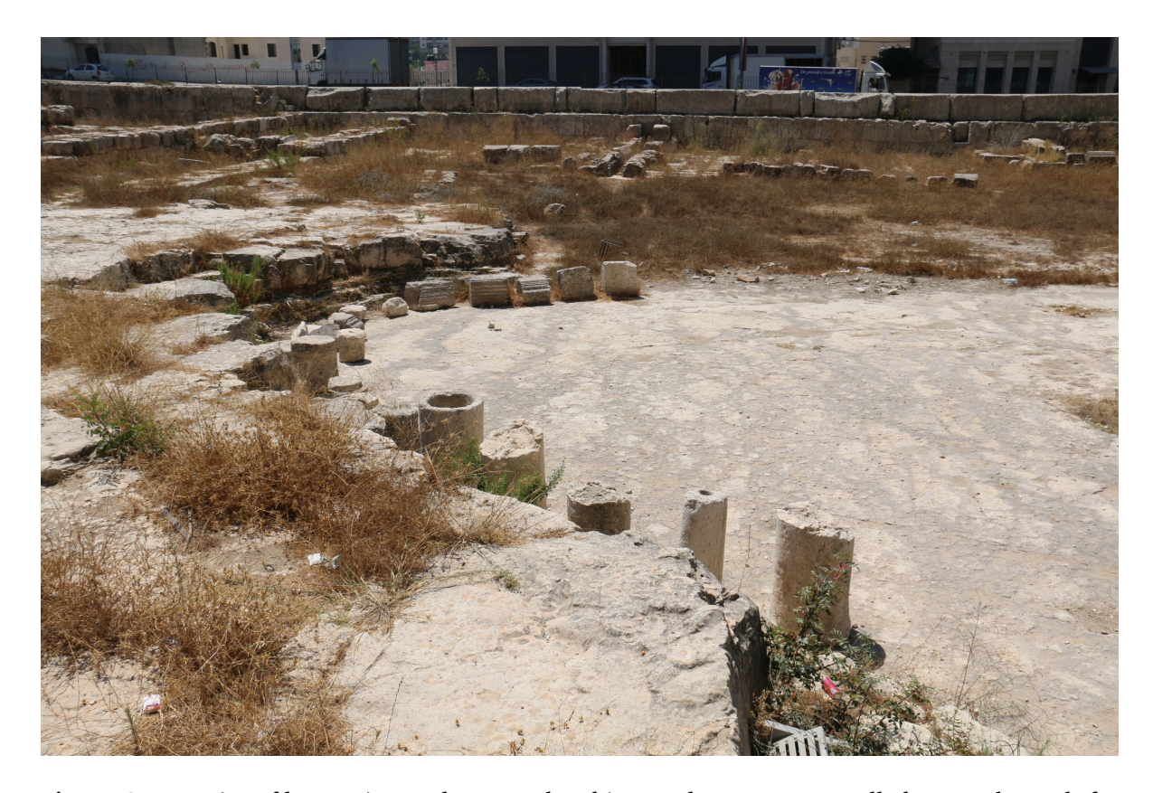
Figure 4 Remains of late antique columns and architectural ornaments, small altars, and vessels for libation sacrifices (and some modern rubbish), as now presented in the formerly open area of the sanctuary.