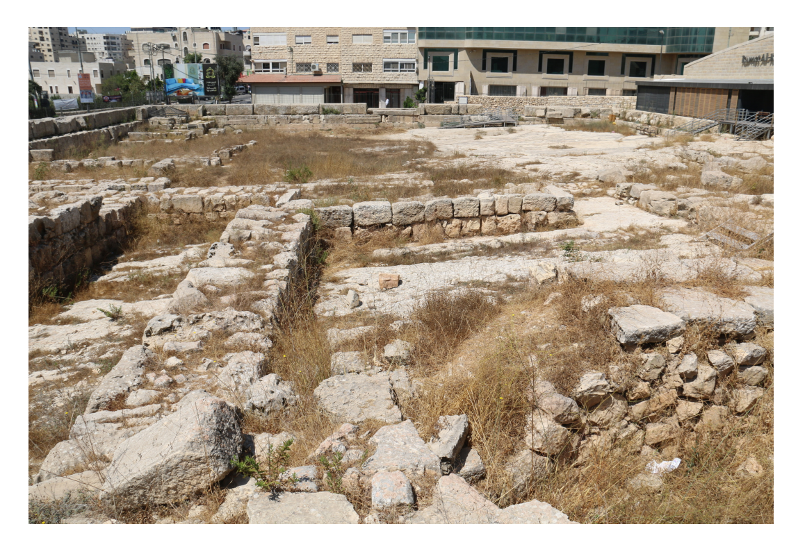
Figure 5 View from the east. In the foreground, the fundaments of the apse and the adjoining rooms of the fourth-century Constantinian Basilica; in the upper left corner, the well and in front of it the area where the tree was located. At the back right, outside of the antique enclosure, the "Centre of Encounter", built in 2015 but never put into operation.