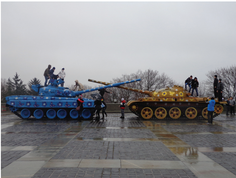
Figure 2. Two tanks at the entry to the Great Patriotic War museum painted in the colours of the Ukrainian flag (Source: photographed by the author, 13 April 2013).

A stand about the OUN and UPA (Fig. 4) was added to the exhibition room dedicated to the partisan movement, offering a narrative that was similar to the way it was represented in school textbooks. It contained the