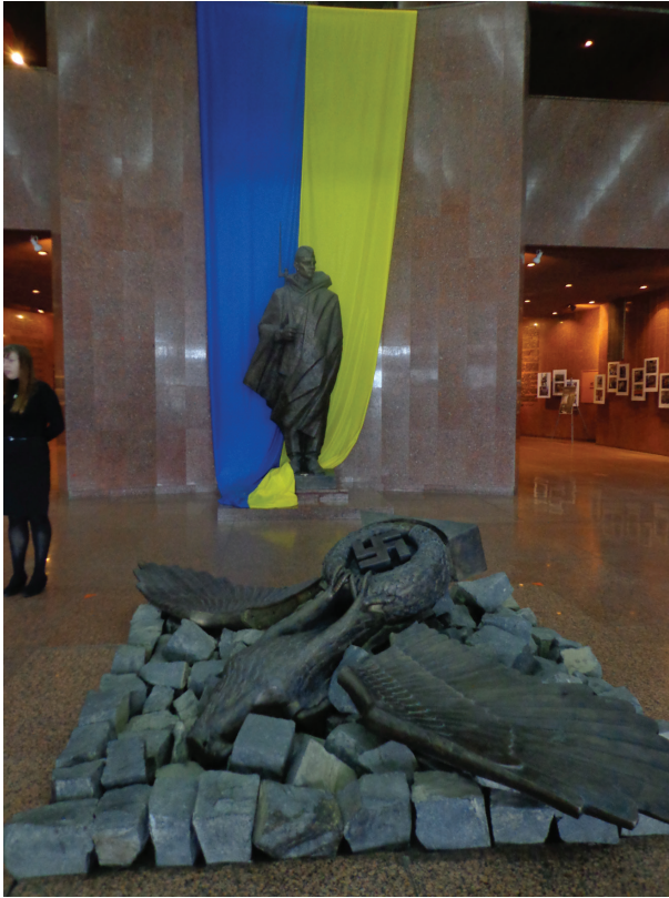
Figure 3. A Soviet soldier in the lobby of the museum in front of the Ukrainian flag (Source: photographed by the author, 13 April 2013).

photos and biographies of several prominent OUN members (excluding Stepan Bandera) and of Roman Shukhevych, some propaganda documents about the organizations, and official documents and letters by the organizations' members. In general, the stand provided little interpretation and allowed the documents to speak for themselves. The materials did not cover any controversial issues or alternative views related to the two organizations. The guided tours observed by the author in the museum in April 2013 and October 2016 avoided the OUN and UPA stand and went directly to a reconstructed dugout of Soviet partisans situated in the opposite corner of the exhibition room. Thus, even if the museum staff had to abide by the official pressure to introduce the OUN and UPA narrative in the museum, it could resist, ignore or subvert it in