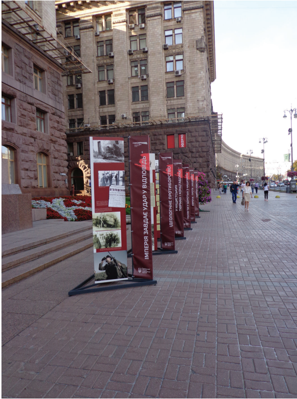
Figure 5. A moving poster exhibition 'UPA – the answer of the unsubdued people' next to the building of the Kyiv City Council.

Furthermore, in the condition of war, the politics of memory was presented as a matter of national security.