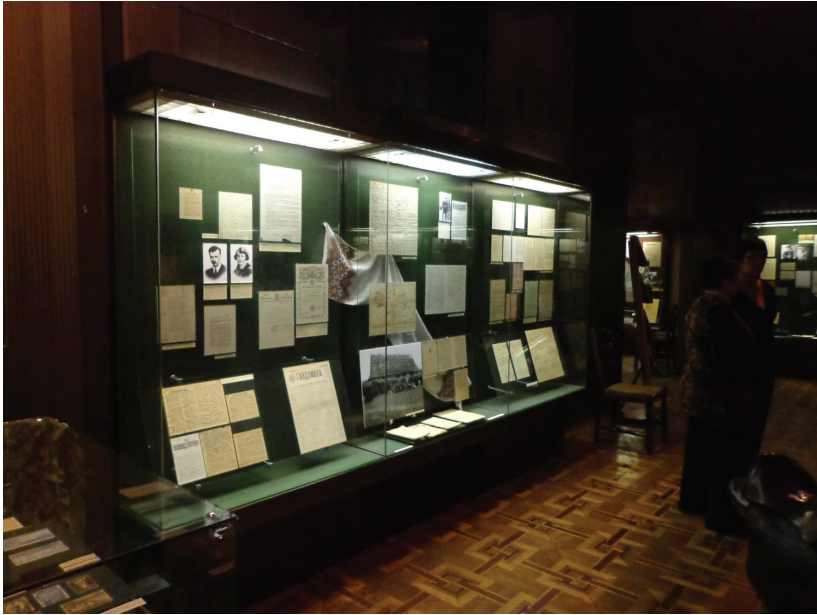
Figure 4. A stand dedicated to the OUN and UPA in Room 8, dedicated to the partisan 'Anti-fascist resistance movement of the Ukrainian people'.

more subtle ways. Some members of the Communist Party of Ukraine and of the Party of Regions protested against the OUN and UPA stand. However, it was not dismantled even during the presidency of Viktor Yanukovich.