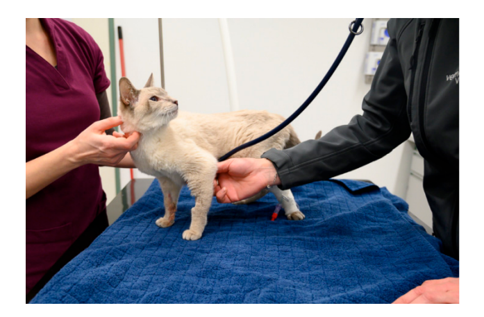
Figure 5. Performing the examination in a position that is most comfortable for the individual and using the minimal amount of fixation needed improves the patients' compliance and well-being. Photo: Christine Arhant, Vetmeduni Vienna.

Figure 4. Use of high-value food (or toys) can increase cooperativeness and promotes positive emotions. Photo: Christine Arhant, Vetmeduni Vienna.