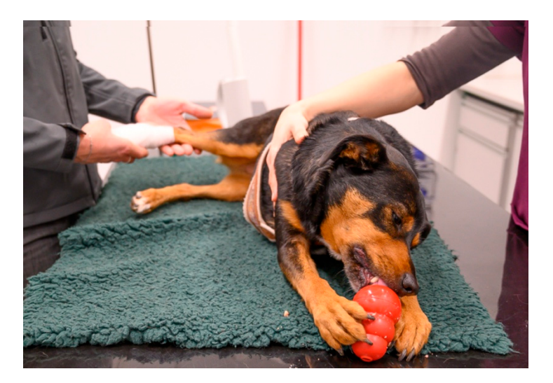
Figure 3. A non-slip mat improves the animal's comfort. By feeding the animal during the examination or treatment, positive associations can be created.