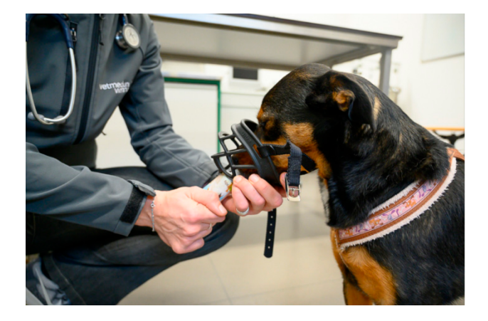
Figure 7. Muzzles increase safety. Food can be used to entice the dog to place its nose into the muzzle and should be offered repeatedly during wearing in order to create positive associations.

Cat muzzles cover both mouth and eyes [24]. However, unlike dog muzzles, cat muzzles can hardly be adjusted to the animal, and cats usually do not receive muzzle training. Soft nylon muzzles are a possibility if visual shielding is the primary aim [24,29], whereas hard plastic muzzles are more suitable for the prevention of bites [24,36]. The ball-shaped "Air Muzzle" (Air Muzzle, SmartPractice, Phoenix, AZ, USA), which can be used for small and especially brachycephalic dogs and cats, encloses the entire head and enables normal breathing. Its advantage is that the handler's hands stay protected behind the device when putting it on [36].