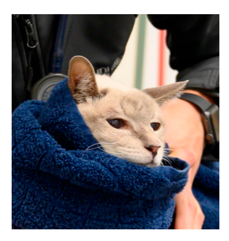
Figure 6. Towels and blankets can be used in various ways for safe restraint of cats and small dogs.

furthermore be used to control the head, especially in small and brachycephalic dogs and in dogs that show fear of the muzzle [24].