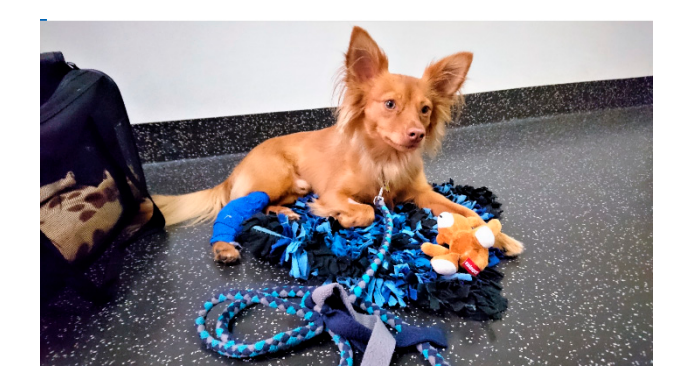
Figure 2. Owners can be advised to bring a blanket from home and to distract the animal with food or toys in order to decrease stress during the waiting time. However, the potential for resource guarding when using toys or chews needs to be considered. Not suitable when sufficient spacing between animals in the waiting area is not possible.

the scale has a non-slip surface and is not set up in a corner [27,40]. Fear of weighing can be reduced by encouraging and rewarding dogs for stepping on the scale on their own [40]. Easy-to-clean dog beds that insulate from the cold floor can improve dogs' comfort [48], even more so if owners bring their own blanket or dog bed [29,36]. Owners can furthermore bring chews or toys to occupy the dog during the waiting time [27,36] (Figure 2).