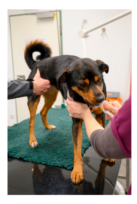
Figure 9. During counterconditioning, a potentially unpleasant or fear-inducing stimulus is paired with a high-value incentive. For optimal results, the start of the potentially aversive stimulus should precede the start of the positive desired stimulus, so that it becomes a predictor of something positive. Thus, the ideal sequence of events is as follows: start touch, then start feeding and continue feeding throughout the touch. When you stop touching, also stop feeding.

be conducted at a level that is over the individual animal's threshold, but when it does happen, a reward should be given anyway, as the best success can be achieved when the contingency between the fear-inducing stimulus and the reward is reliable [106]. If the animal does react fearfully or even aggressively, this is a clear sign that the situation needs to be adjusted in a way that helps the animal to keep feeling safe [109], such as by changing the training plan or the use of anxiolytics when necessary [27,37,38].