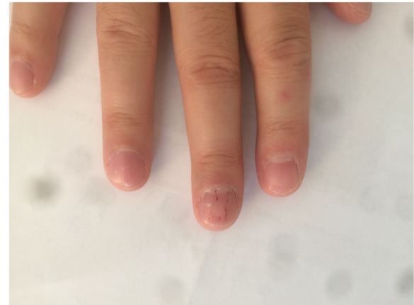
Fig. 1 A 2D tattoo prototype of splinter nails on a healthy 40-year-old SP's middle finger, intended for a case of bacterial endocarditis. The haemorrhages should be less sequential but continuous, parallel to each other as well as the nail's growth lines. The colouring suggests an old subungual haemorrhage