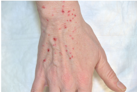
Fig. 3 The 2D Tattoo affixed onto an SP. The knuckles and back of the hand were left out, as regular flexing would have broken the print

also increases their acceptance, since the experts were involved right from the start. To date our team developed and set up a manufacturing process. In the future, more exchange and cooperation with other simulation educators would be desirable. Our approach to evaluation of the moulages has so far been predominantly qualitative. In the future, this could also be done in a quantitative manner, e.g. using the MARS instrument [25] and include their effect in simulations [2].