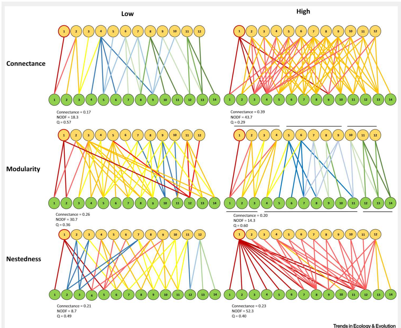
Figure 1. Example Unweighted (for Simplicity) Networks Created by Randomly Compiling Plant–Pollinator Networks at a Predefined Connectance ( C = 0.15 in Network with Low Connectance; C = 0.40 in Network with High Connectance; C \approx 0.20 in Other Networks). Networks are composed of 12 pollinator species (yellow nodes) and 14 plant species (green nodes). Possible routes of disease spread, starting at pollinator species 1 are displayed by indicating path length between nodes (1, dark red; 2, light red; 3, orange; 4, yellow; 5, dark blue; 6, light blue; 7, light green; 8, green; 9, dark green). High connectance and nestedness may increase disease spread, while high modularity may keep disease spread limited to the affected module. In the network with high modularity, the three modules are indicated by horizontal lines. In the highly nested network, specialist pollinators visit a subset of plants visited by generalists. Abbreviations: NODF, nestedness metric based on overlap and decreasing fill; Q, Newman’s modularity.

expect that pathogen spread within a pollinator population or interspecific spillover may be reduced or exacerbated by: (i) invasions by novel species or subspecies [17] (Figure 1C); (ii) the extirpation of pre-existing populations or species [62] (Figure 1C); (iii) modification of the relative abundance of species and dominant interactions [63] (Figure 1D); (iv) disruption of species’ phenology [64,65] (Figure 1D); (v) shifting species distributions at landscape, regional, or global levels [62]; or (vi) changing species physiology, altering disease resistance, infectivity, or virulence [17,66] (Figure 1E). While scientific and policy awareness of pressures on wild pollinators has increased and led to regulations at various levels protecting pollinators and their habitats, less regulatory