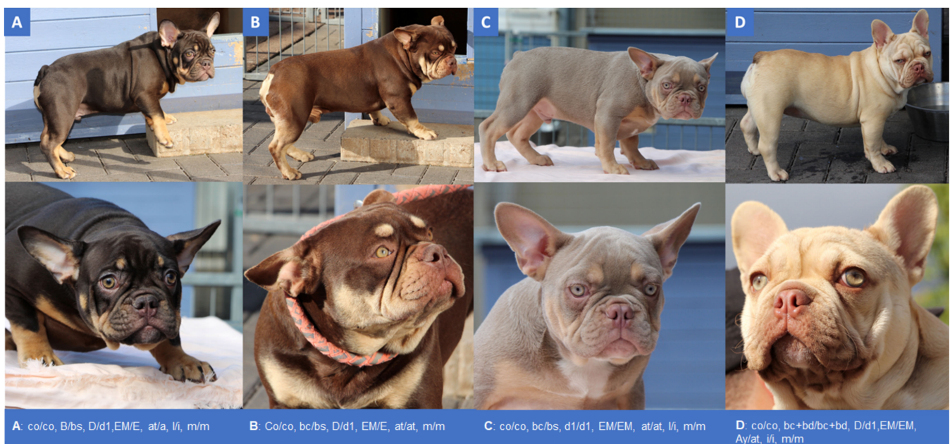
Figure 1. Cont.

We obtained photographs from 20 French Bulldogs with different coat color genotypes, including five co/co dogs (Figure 1, Table S2). We confirmed the earlier observation that the eumelanin coat color in adult cocoa dogs ( co/co ) is of a darker brown shade than the eumelanin coat color in TYRP1 deficient dogs ( b/b ) (Figure 1A,B) [5]. However, the data also illustrate an enormous complexity of additive and/or epistatic gene–gene interactions of HPS3 and TYRP1 with other coat color genes. It is often not possible to deduce the underlying genotype from the phenotype. At the same time, genotyping only the HPS3 gene alone does not allow one to make reliable predictions of the coat color of a French Bulldog. The comprehensive characterization of the coat color of a French Bulldog often requires the genotyping of several coat color loci.