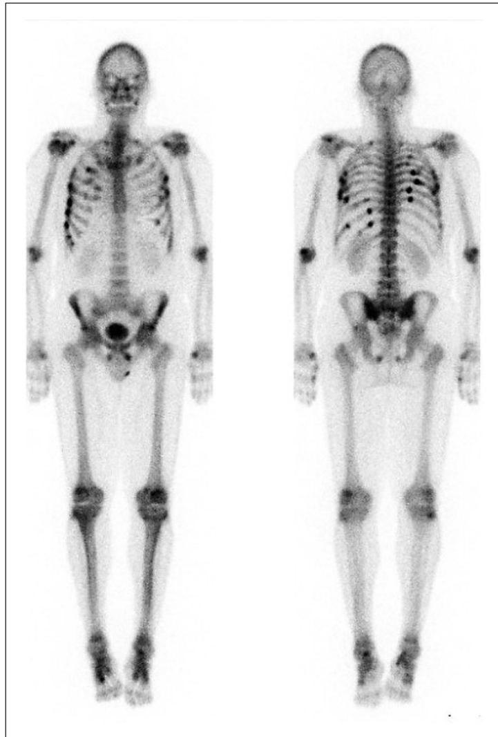
Fig. 1. Whole-body bone scintigraphy showing multiple pathological fractures.