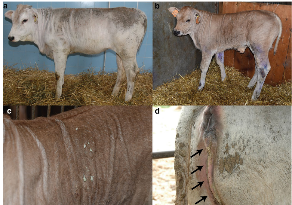
Fig. 1 Clinical characterization of Chianina cattle affected by ichthyosis congenita. a Note the dry, greyish skin with scale-like hyperkeratosis over most of the body surface (case 1). b Note the multiple wrinkles, folds and wounds secondary to the hyperkeratosis (case 8). c Higher magnification of b from the skin of the thoracic region. Note the pyoderma. d Note the urolithiasis characterized by the presence of small stones and crystals (arrows) on the perigenital region (case 7)

(Fig. 1b). No abnormalities were observed at the level of the mucocutaneous junctions. One of the animals (case 8) also showed secondary wounds and pyodermatitis (Fig. 1c). Urolithiasis evidenced by the presence of small stones and crystals in the perigenital region (Fig. 1d) accompanied the cutaneous disease in cases 1, 7, 8 and 10. A hypoglycemic and hypothermic crisis that provoked the death of case 8 during the winter season was interpreted as a secondary phenomenon of imbalanced thermoregulation capacity. No abnormalities were registered at the level of the cardiovascular, respiratory, musculoskeletal, and nervous systems in any animals.