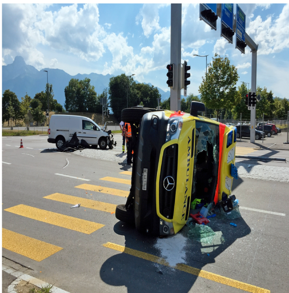
Figure 1. Collision of a delivery van with an ambulance using blue lights and sirens on the way to a patient in Thun, Switzerland.

Austria, Germany, and Switzerland have comparable organizational structures and response systems for ambulance services, which are provided by multiple emergency service providers in each city, municipality, or region. Austrian Ambulance Emergency Services (AAES) are organized individually by each of the nine federal states and by some cities (Vienna and Graz). The AAES is efficiently coordinated