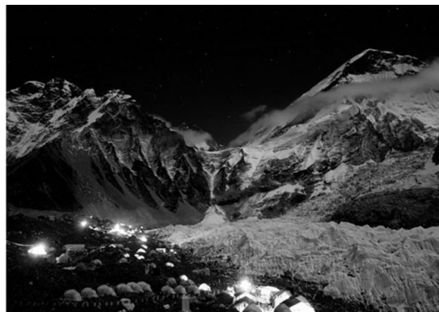
FIG. 1. Study site of the field study, EBC. EBC, Everest Base Camp.

The following data were collected as self-ratings: socio-demographic data, data on lifestyle habits and past medical history, data related to the altitude climb, including data