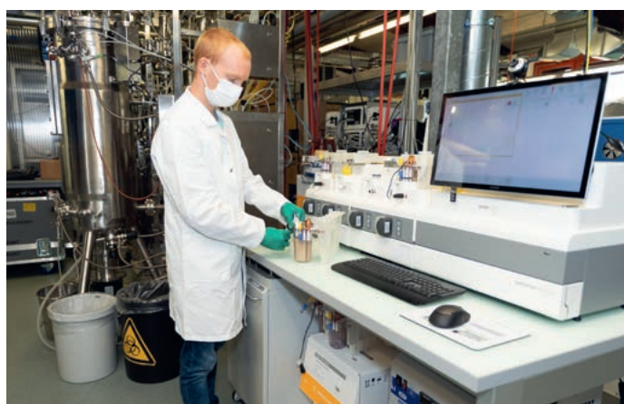
Fig. 1. ambr 250 modular used for the first scale-up step of the upstream processing of SARS-CoV-2 VLP production in the technology room of ZHAW's Center for Biochemical Engineering and Cell Cultivation Techniques

showed the best results. Both media were used in subsequent shake flask studies (using 250 and 500 ml baffled shake flasks and the KuhnerTOM online gas analyzer) and modified for fed-batch applications (feeding). The codon optimized clone (clone no. 3) was found to give the highest product concentrations in the soluble supernatant and was therefore selected for the bioreactor experiments in the ambr 250 modular from Sartorius (Fig. 1) and the BIOSTAT D-DCU D-30-3 (Sartorius). The ambr experiments indicated a strong dependence of VLP concentration on the length of the production phase and the feeding regime implemented in the production phase. Thus, to ensure high VLP concentrations, excess of carbohydrates was to be avoided. In the ambr 250 modular as well as in the BIOSTAT D-DCU D-30-3, the highest VLP concentrations were obtained using 2-YT medium. Although the maximum OD_{600} values (261.2) and total VLP concentrations ( 2.55 \text{ g l}^{-1} ) of the ambr 250 bioreactor runs were not achieved, the two proof-of-concept cultivations realized in the BIOSTAT D-DCU D-30-3 demonstrated the scalability of the developed upstream processing method for SARS-CoV-2 VLP production.