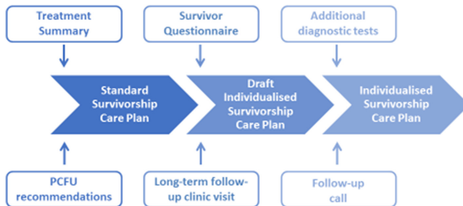
Fig. 2. Development timeline of the individualised Survivorship Care Plan. PCFU, PanCareFollowUp.

Development of the Survivor Questionnaire started with the establishment of a core group (including H.P., L.K.,