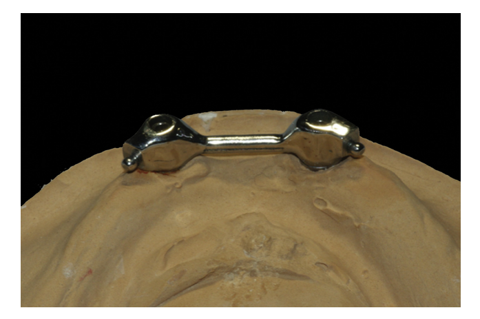
Figure 1. Overdenture bar with distal attachments.

Statistical analysis was performed by using a software program (SPSS Statistics v17.0; SPSS Inc). All numerical data were expressed as median values (minimummaximum). For each continuous variable, normality was checked with the Kolmogorov-Smirnov and Shapiro-Wilk tests and by histograms. Comparisons were made using the Mann-Whitney U test as the data were not