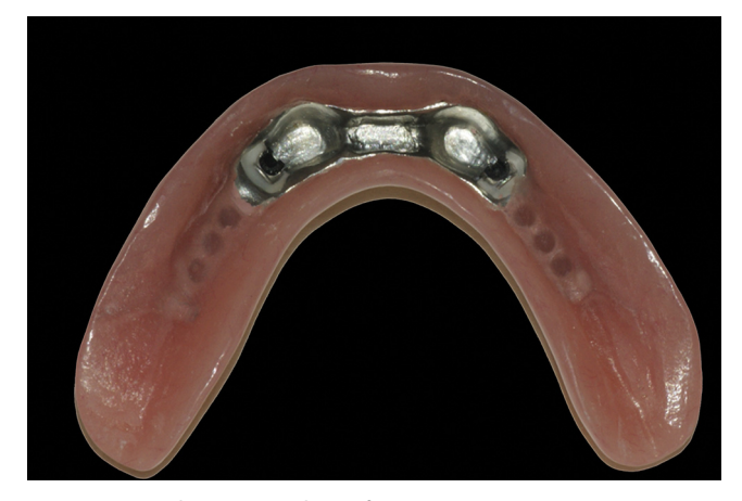
Figure 4. Overdenture intaglio surface.

most common complication was the wear of a polymer attachment, which was observed in 72.6% of the participants followed by bar screw loosening seen with 10.9% of the participants. The need for relining and fracture of opposing prostheses (The prostheses were repaired from the fracture line.) was observed with 8.2% of the participants. Fracture at the midline of prosthesis, debonding of teeth from the resin base, and bar clip fracture were each seen in 6.8% of the participants. The need for rebasing was seen in 5.4%; bar fracture in 4.1%; implant loss (Two Zimmer Biomet implants were lost.) and resin base fracture in 2.7%; bar screw fracture, abutment screw loosening, and overdenture clip detachment each in 1.3% of the participants (Fig. 5). The mean ±standard deviation time for the first change of the polymer attachments was 3.72 \pm 2.2 years, and the mean \pm standard deviation number of changes was 1.74 \pm 0.86 per study participant. The number of times an attachment was changed was 1 for 21 study participants, 2 for 16 study participants, 3 for 12 study participants, and 4