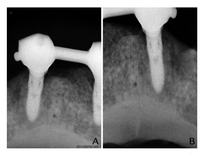
Figure 3. Representative postoperative periapical radiographs. A, Left implant. B, Right implant.

most common complication was the wear of a polymer attachment, which was observed in 72.6% of the participants followed by bar screw loosening seen with 10.9% of the participants. The need for relining and fracture of opposing prostheses (The prostheses were repaired from the fracture line.) was observed with 8.2% of the participants. Fracture at the midline of prosthesis, debonding of teeth from the resin base, and bar clip fracture were each seen in 6.8% of the participants. The need for rebasing was seen in 5.4%; bar fracture in 4.1%; implant loss (Two Zimmer Biomet implants were lost.) and resin base fracture in 2.7%; bar screw fracture, abutment screw loosening, and overdenture clip detachment each in 1.3% of the participants (Fig. 5). The mean ±standard deviation time for the first change of the polymer attachments was 3.72 \pm 2.2 years, and the mean \pm standard deviation number of changes was 1.74 \pm 0.86 per study participant. The number of times an attachment was changed was 1 for 21 study participants, 2 for 16 study participants, 3 for 12 study participants, and 4