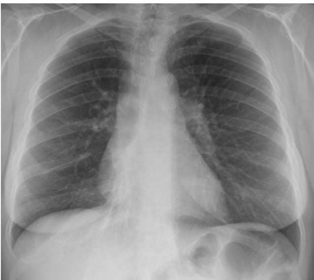
Figure 2: Chest X-ray at postoperative Day 3 showing a well-expanded right lung with only minor residual atelectasis at the base.

Computed tomography scan at 1 year follow-up (Video 2) showed no signs of recurrence and a well-ventilated basal pyramid.