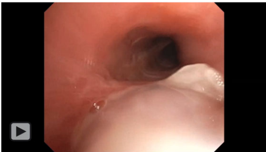
Video 1: Bronchoscopic endobronchial debulking of the tumour.

Subsequent chest X-ray (Fig. 2) showed a well-expanded right lung with only minor residual atelectasis at the base.