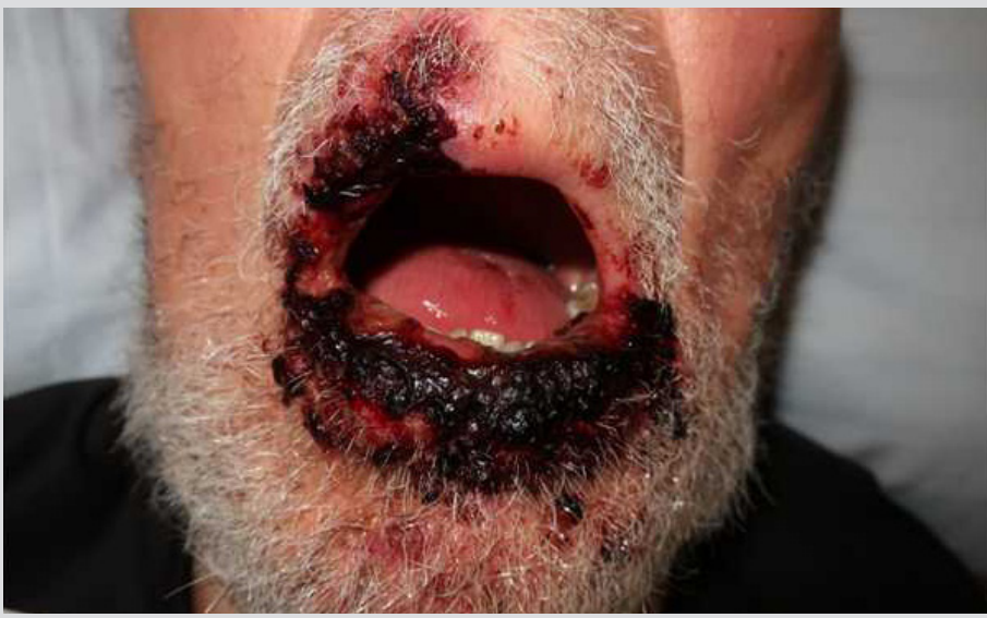
Figure 1. Acute presentation of a patient with Fuchs syndrome with extensive involvement of the oral mucosa secondary to severe HSV-1 cheilitis