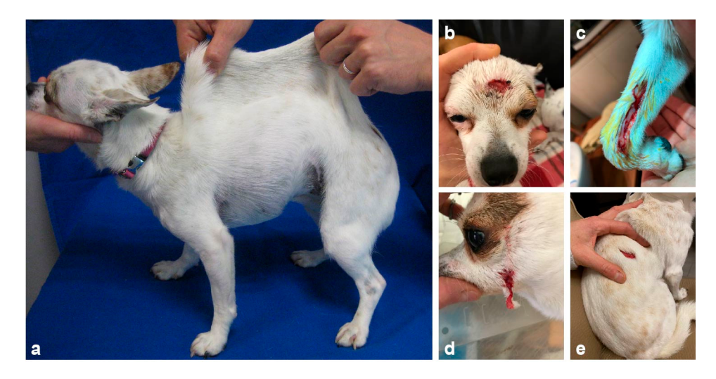
Figure 1. Clinical signs of the classical Ehlers-Danlos-affected Chihuahua dog. ( a ) Skin hyperextensibility over the dorsum. ( b ) Skin laceration resulting from minimal trauma on the head, ( c ) on the forelimb, ( d ) on the lower jaw, and ( e ) on the dorsum.