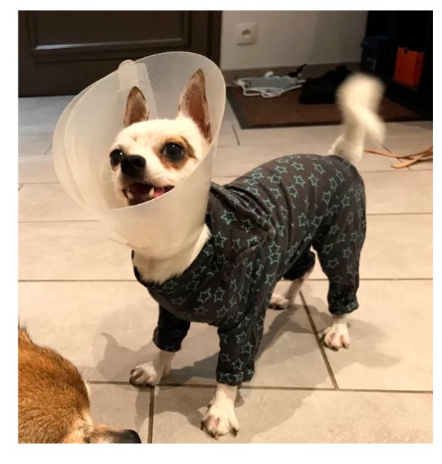
Figure 2. The dog lives continuously with a protective suit and an Elizabethan collar to prevent wound formation.